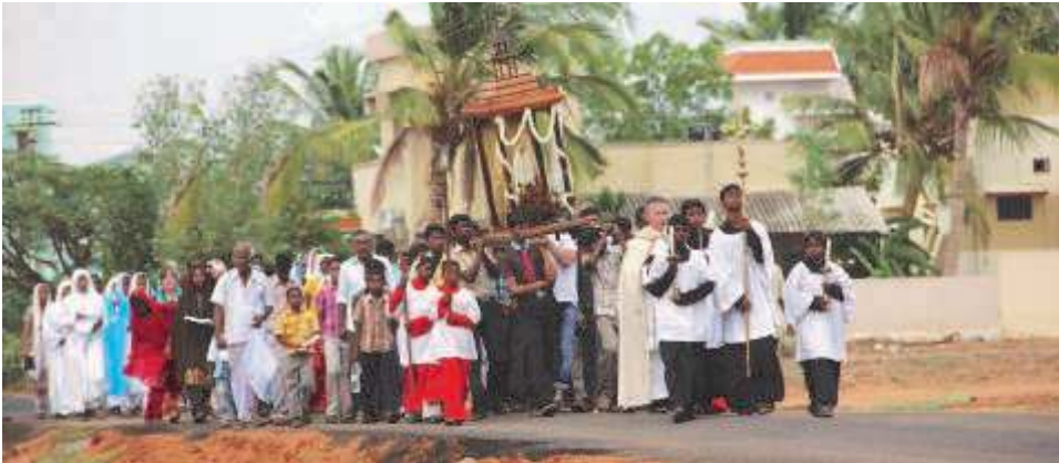
The rosary procession from Veritas Academy to the priory on the Feast of Holy Rosary 8th October.