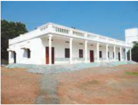
The New Boys Dormitory & Study Hall thanks to our benefactors