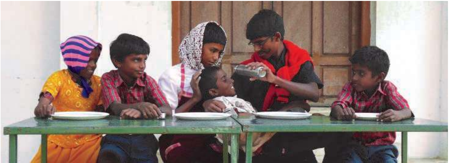
Domestic bliss in the Cratchit household. A scene from Charles Dickens' A Christmas Carol.