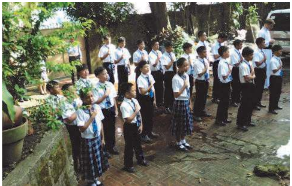
Morning Prayers and the National Anthem before school.

have over the OLVS boys, however, is a predilection for violent games, but I am sure this will come with time.