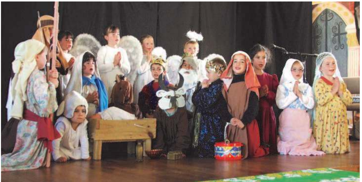
No room at the inn, but plenty of room on the stage for the St. Anthony's Junior School nativity play.

The Secondary School end of year prize-giving held on December 1st was an occasion of celebration for many students