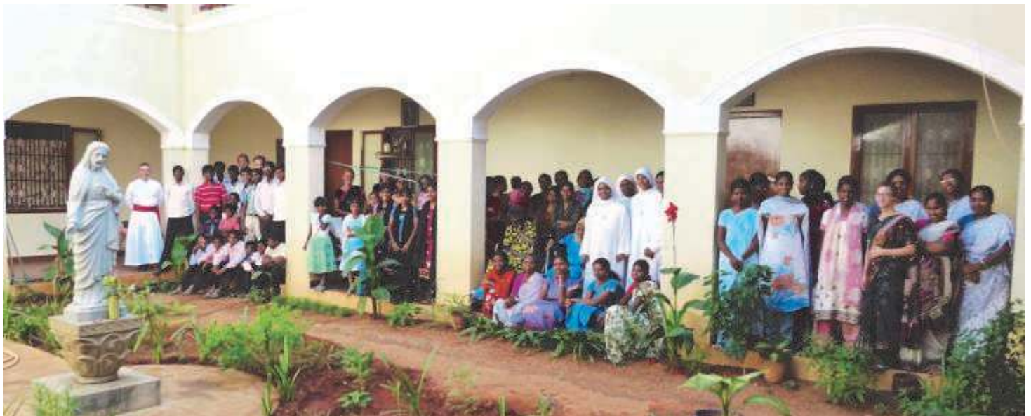
Christmas 2011 at the Orphanage.