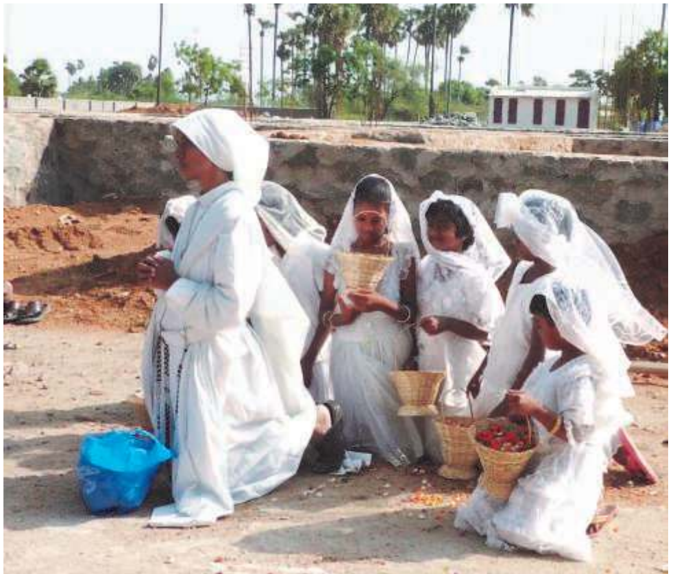
Maids of Honour at the Corpus Christi procession earlier in the year.