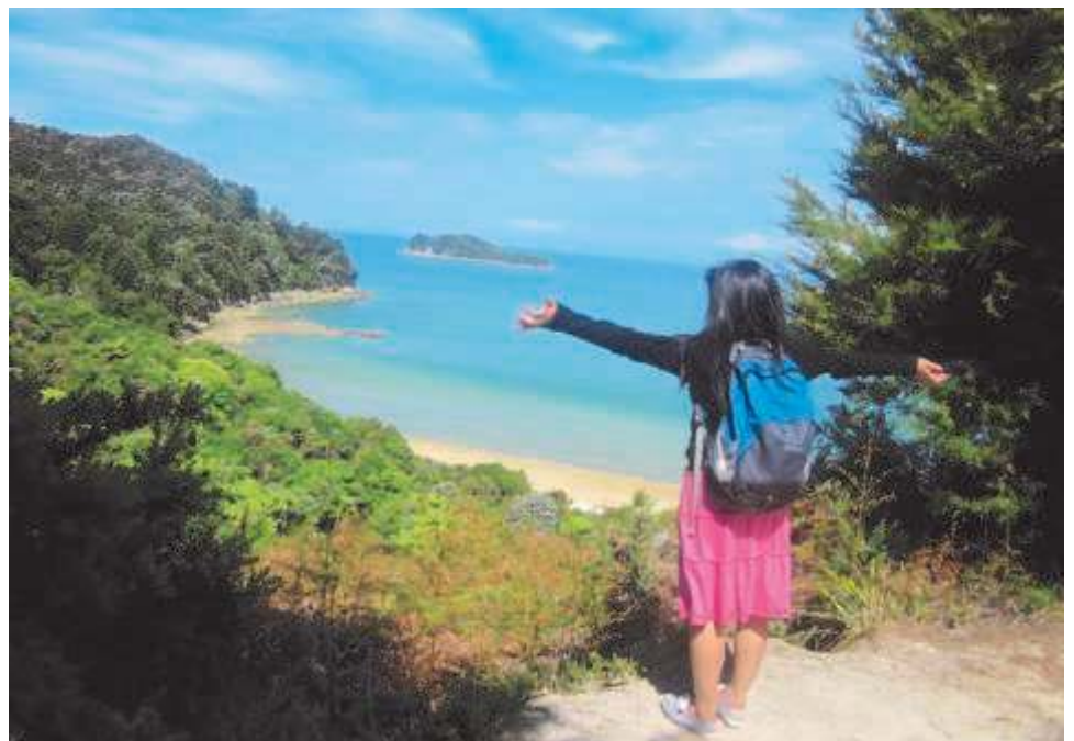
"My Lord, if this is to be my exile, what will heaven be like!"