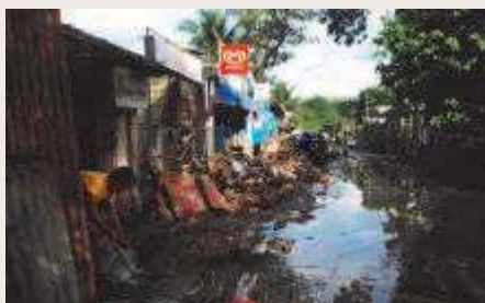
Aftermath of the flood: mud and more mud.