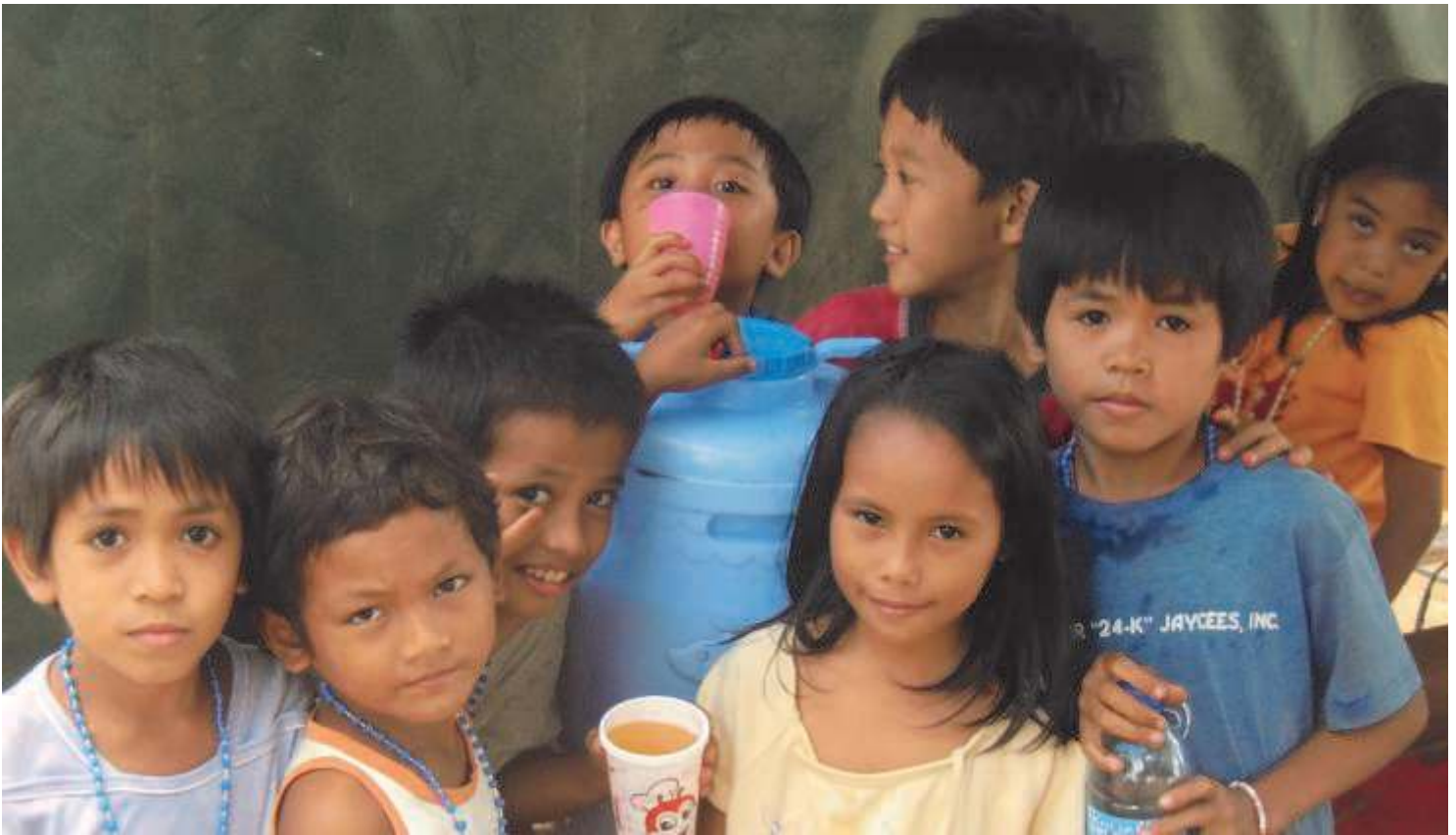
Flood victims: children of Mindanao, Philippines with new rosaries and relaxing at the makeshift juice bar.