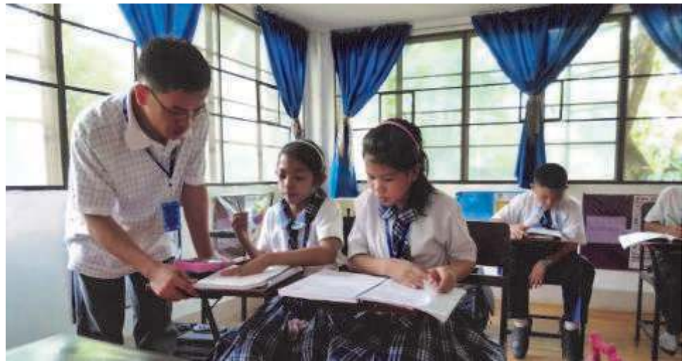
Grade 4 with Mr. Renoir. Small class sizes make teaching and learning much more effective.

The children were all very polite and, unlike our ragamuffins at Palayamkottai, it was not possible to tell what they had eaten for breakfast by an examination of their smart uniforms. One thing our boys