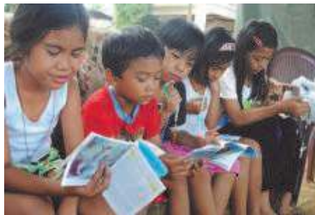
Children absorbed in their new rosaries and prayer booklets.

find one priest struggling with 18,000 parishioners. The natural solution was adopted and lay catechists were formed and they did great work in educating the youth and in maintaining the faith so that the sacraments were fruitfully received. This work of forming catechists was taken very seriously and applied with vigour. For instance, the Catholic University in Osamis, was originally an institution for training a large body of well-prepared