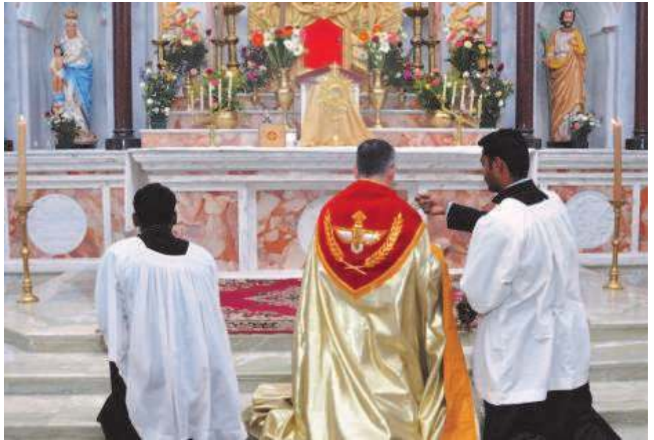
The new altar at St. Thomas' Chapel, Nagercoil, covered in flowers, made the Feast of St. Thomas especially memorable this year.

tion of the natural order, which includes the perfection of the family, is impossible without grace . For a family to be truly functional, it must be truly religious. It must take the Holy Family as its model and must aspire to supernatural virtue through, not only material means (eating and sleeping well, shutting out the evil influences of the world, etc.), but especially by frequentation of the sacraments, prayer in common (the family rosary) and a practice of virtue.