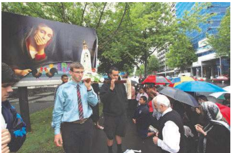
Soldiers of Christ make reparation in front of the blasphemous poster.