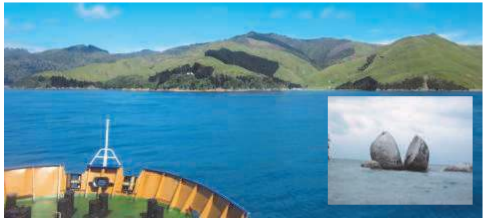
Wonderful scenery from the antipodes

The girls' camp at Nelson, South Island in December was full of high adventure.