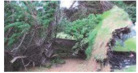
A large Macrocarpa tree came down in the playing field at the school.

I must extend my heartfelt gratitude to the many faithful throughout NZ who contributed so many items – from garden tools and kitchen appliances to pianos for this year's annual Gala. The Gala was a huge success, raising just over $10,000. The number and quality of stalls were