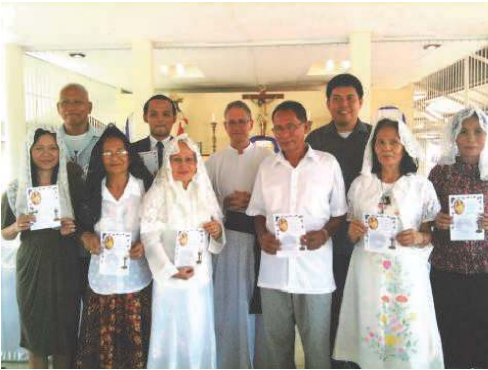
Nine souls were received into the Third Order of St. Pius X at Cagayan de Oro on 11th March 2012. These are the first in the 20 years of the Philippine mission, but they will not be the last for there are more preparing to be received in October or November 2012.