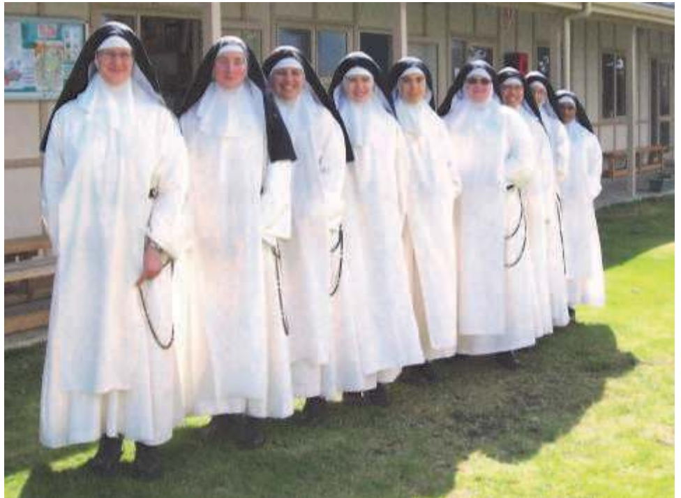
The Community left in Wanganui, New Zealand

step now is to build a big Motherhouse to house all the sisters.