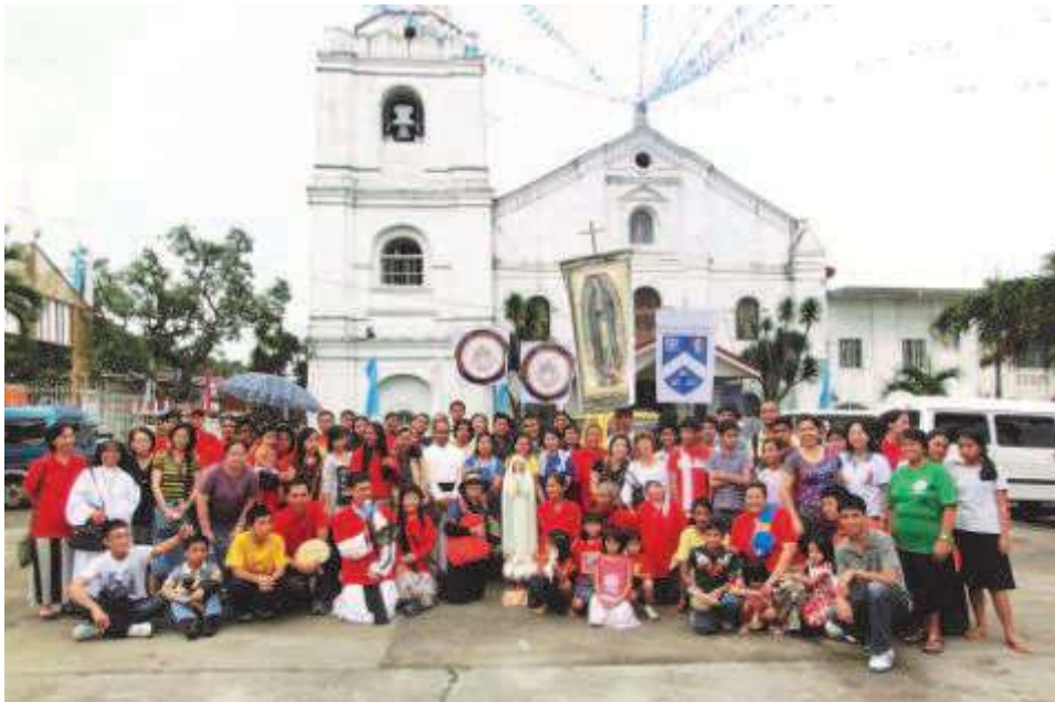
Every year for the feast of Our Lady of Guadalupe, on 12th December, the faithful of the of the Philippines make a pilgrimage to Laguna. The pilgrimage lasts a whole day starting from Pakil and finishing at the church of Our Lady of Guadalupe in Pagsanjan. This year about 200 faithful joined including all the brothers and novices of St. Bernard's Novitiate, Iloilo.