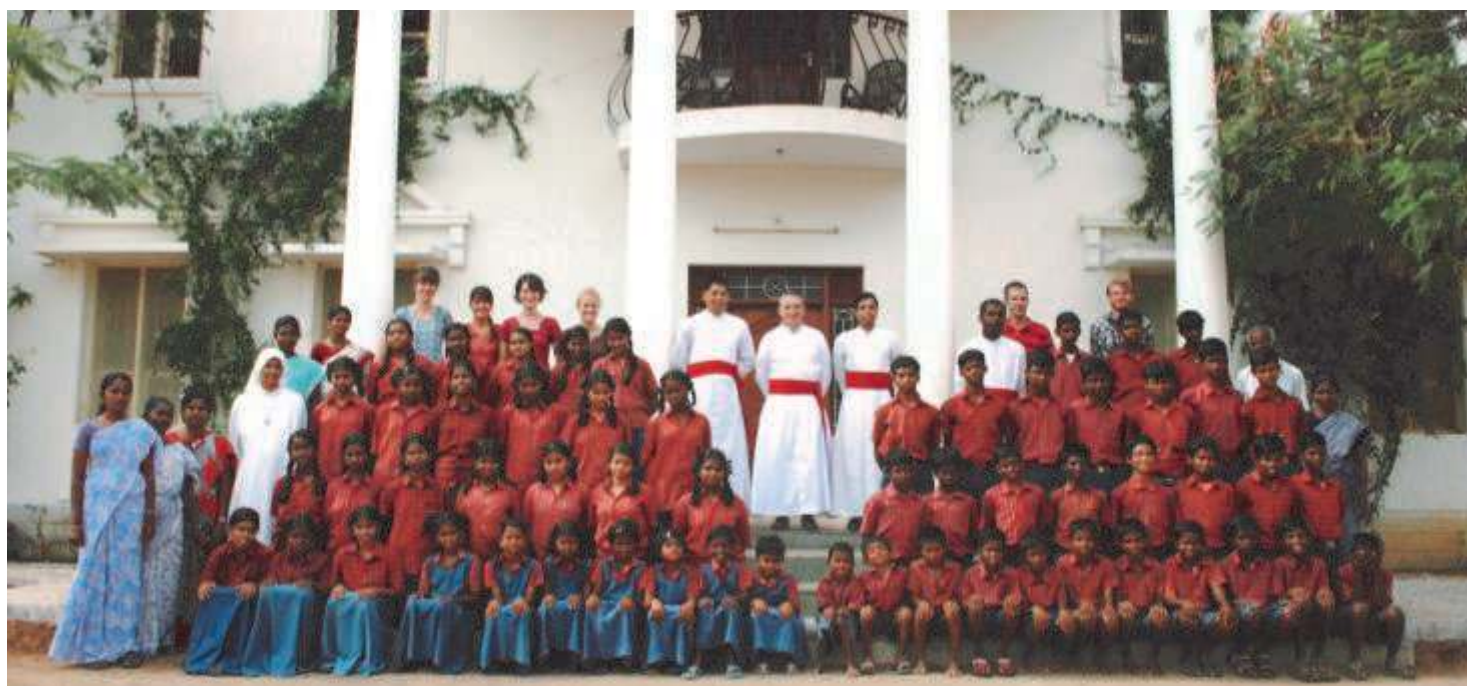
Veritas Academy 2011-12.

May God grant us priests, teachers and plenty of children for our schools. May Catholic parents receive the grace to love their children enough to make the sacrifices necessary for their Catholic education. May our heavenly Mother, our Sedes Sapientiae , hold our schools in her tender care. Ω