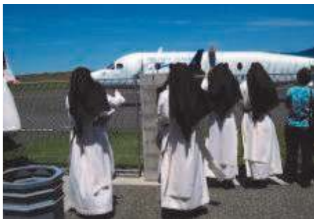
"All aboard for Tynong!"