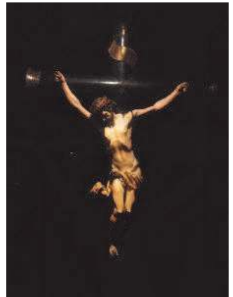
17th Century Crucifix from the old Seminary of St. Augustine in Manila.

Why such a long wait? Why so few? Oh that Television! One of the rules of the 3rd Order: No Television. Why? The 3rd order commits itself to helping the Society in the battle for the faith. But how will a member do so if he invites the enemy to sit down and relax with him in his own home? He wants to fight for the rights of Our Lord Jesus Christ but how can he do this if he drinks in like water the poison of the anti-Christ from the Television? Impossible. Alas alas, how few, how very few there are who are ready to offer themselves for this great cause!