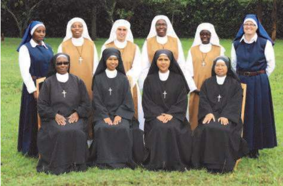
Front row: The Oblate Sisters of the Society of St. Pius X Back Row: The Missionary Sisters of Jesus and Mary