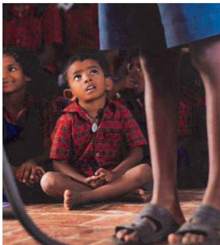
"One day I want to be like him." Brighten looks up to his role model.

§65. Far too common is the error of those who with dangerous assurance and under an ugly term propagate a so-called sex education, falsely imagining