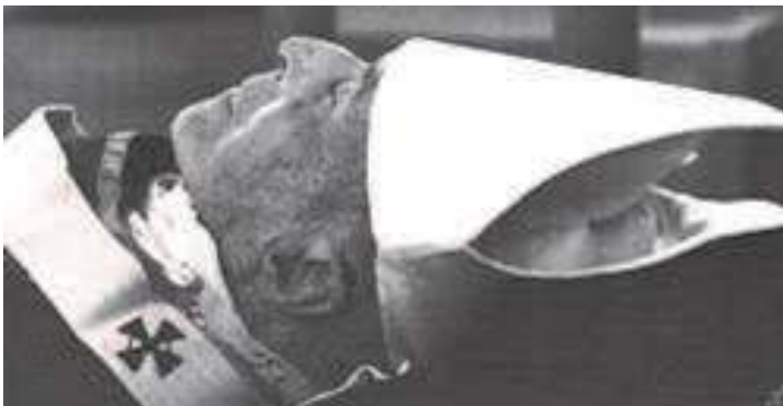
The Archbishop with the pallium (received from Pius XII): “We adhere to the Eternal Rome.”

(Moto proprio Ecclesia Dei 2 nd July 1988)