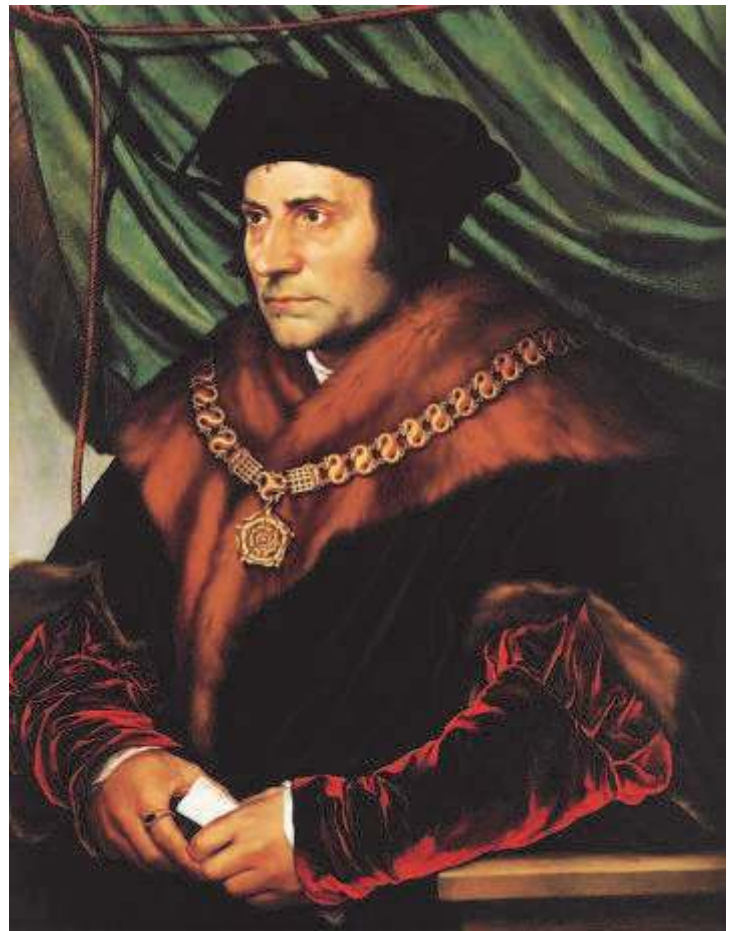
Sir Thomas More, Lord High Chancellor of England. (Portrait by Hans Holbein the Younger)

(The Trial of Thomas More: 1st July 1535)