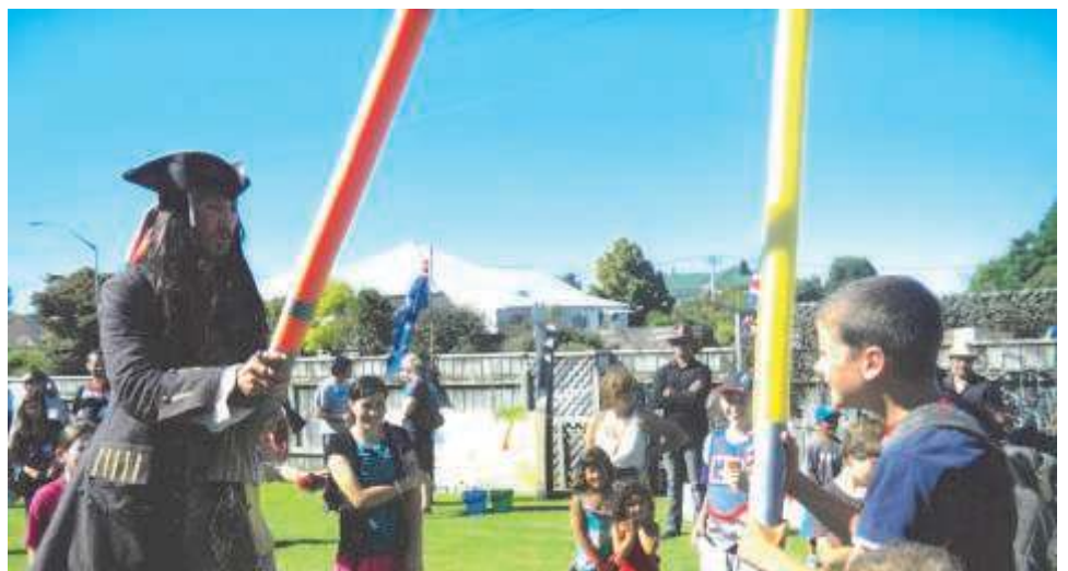
St. Anthony's Parish Gala attracted a number of interesting characters.

Only last October our Avondale Mass centre in Auckland was hit by a tornado which damaged the roofing, fencing and wall of our buildings and property there. In March, 2012 our parish and schools in Wanganui suffered similar losses. However during February the boy's school was burgled losing over $5000 worth of computer and electronic equipment. The school is poor and in much need of these items, so the loss was a real sacrifice for the boys and a small headache for the