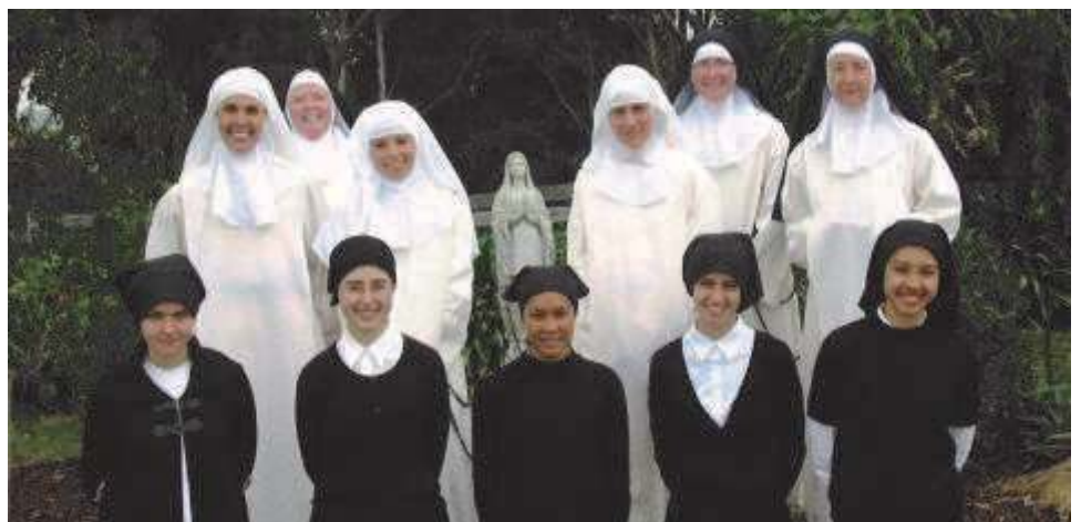
Mother General with community (including one postulant from Singapore and one from the Philippines) in Melbourne, Australia, now the Motherhouse.