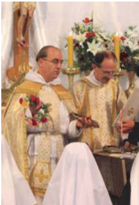
“Roses or Thorns?”