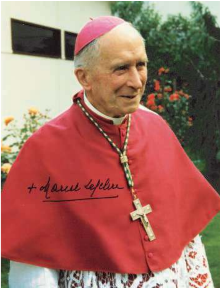
Archbishop Marcel Lefebvre, Archbishop & Bishop Emeritus of Tulle, Founder of the Society of St. Pius X.