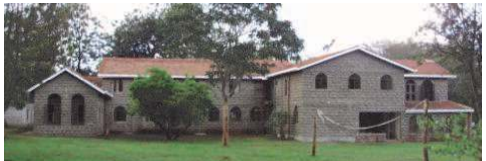
Our Lady of Angels House

Contact: ourladyofangelsnoviciat@gmail.com