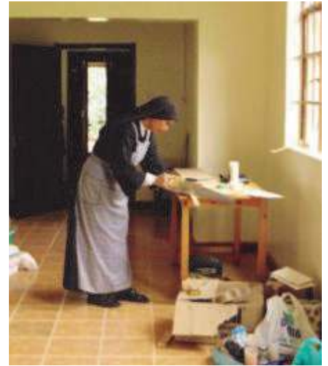
Sister has a great devotion to St. Joseph.

The whole community also has some moments of relaxation. Every day the sisters go for a walk after lunch for about half an hour, and on second Wednesdays, the novices and postulants go for a long walk for the whole afternoon. On the last Wednesday of the month the whole community goes out for a picnic at a green park where they spend most of the day in innocent games, not forgetting, of course,