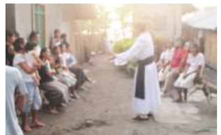
Catechism in Ladol, Alabel, Sarangani Province to counteract the Seventh Day Adventists' mission.