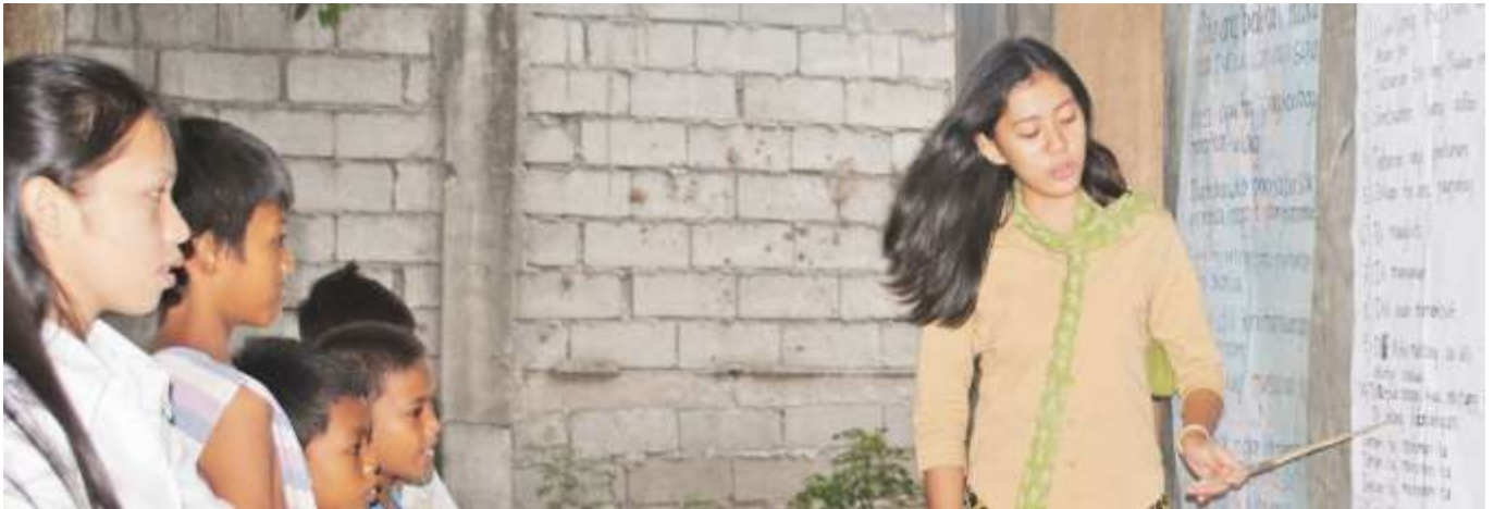
Miss Flores de Mayo teaches catechism at FVR Village, Mindanao

guidance provided by the nurse, who then performs the critical follow-up, based on the instructions of the priest. It's a fairly good and efficient system, and without it, there could be no real development of the mission Mass Centers.