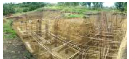
... but it takes more than a few drops of water to stop Fr. Daniels. The water was pumped out and the project continued...