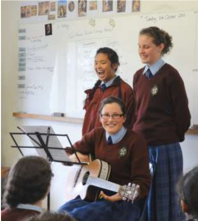
“Let’s sing a song girls! Just think, we never have to go home again!”

As we celebrate 10 years of growth and blessings, it is with great happiness that we announce that the Dominican Sisters of Wanganui are now in a position to open a girls’ boarding school in New Zealand to enable INTERNATIONAL and NATIONAL students to profit from a well-balanced traditional Catholic education under the influence of religious Sisters, while at the same time gaining credit for internationally recognised qualifications. Miraculously we have been able to purchase a large beautiful two-storey house with a double section literally right next door to the existing convent which has much potential for future growth.