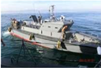
Multi-purpose Attack Craft – a handy asset for a missionary in the Philippines.

The area is a haven for militant Islamic separatist groups.