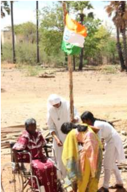
The Indian Flag is patriotically hoisted on Indian Independence Day on 15th August to commemorate the lifting of the sweet yolk of the Raj from weary shoulders in 1946.