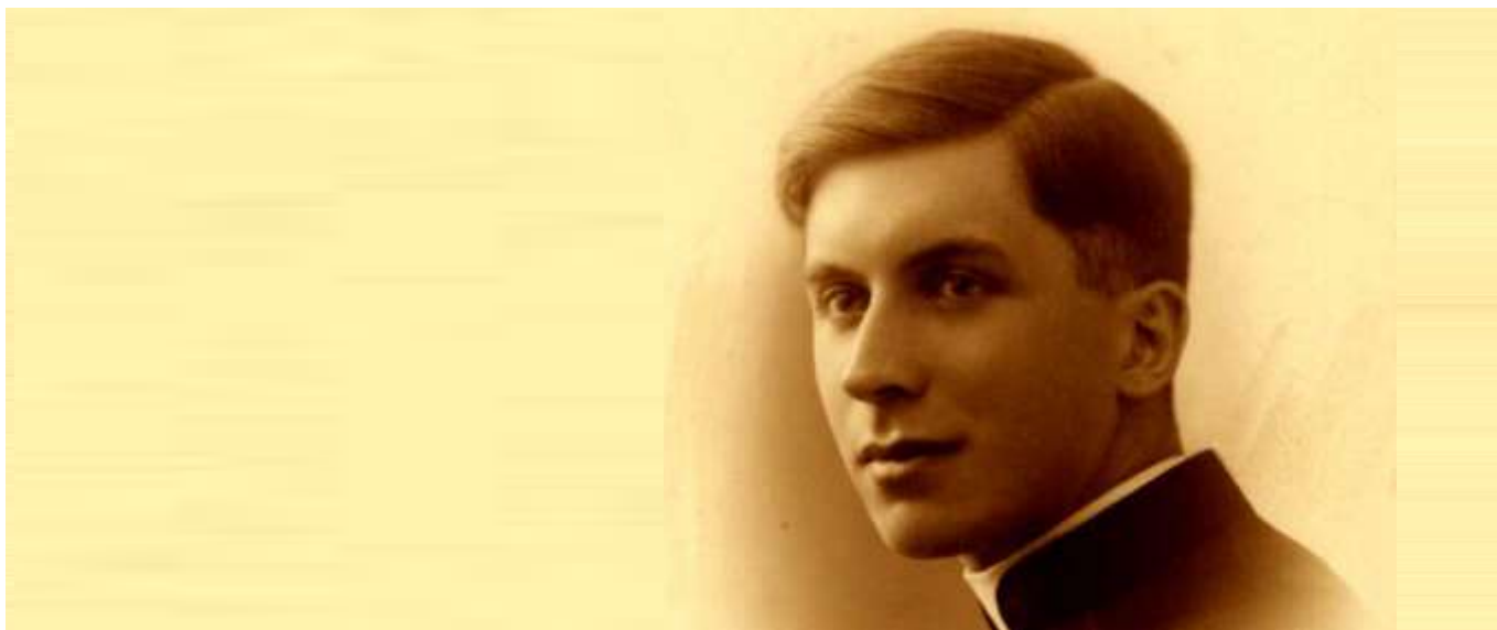
Marcel Lefebvre as a seminarian circa 1928.

It was again this mysterious will of God that urged him, after his resignation as Superior General of the Holy Ghost Fathers in 1968 and already aged 63, to do something for a few seminarians in search of a truly Catholic bishop and seminary. Thus the Society of St. Pius X was conceived and born as a proper religious institute of the Roman Catholic Church, outside of which there is no salvation.