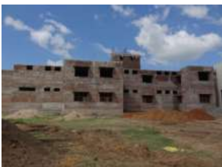
The phase II project is within sight of completion. Divine Providence has blessed us through the generosity of our benefactors to such an extent that we have not had to borrow a single rupee. When the building is finished, the girls (and the old ladies ...and even the sisters) will be able to play hide and seek all day and still not be caught!