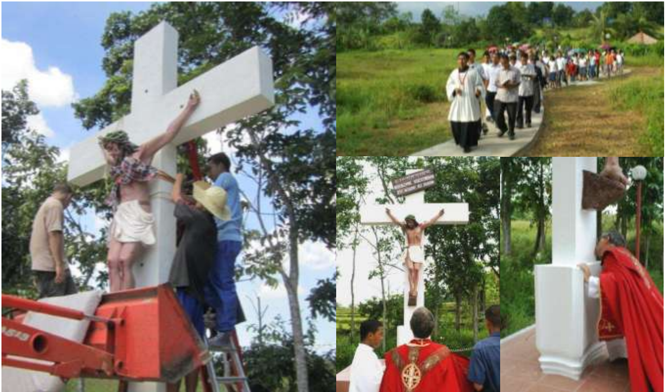
We judged not ourselves to know anything among you, but Jesus Christ, and Him crucified. (1 Cor 2:2). Thanks to our benefactors, a new Calvary has been constructed and solemnly blessed at the novitiate.

church. Whether there be many faithful or no faithful at all makes little difference to the immense importance that the church building plays in the life of the Novitiate. It is the home of the consecrated soul.