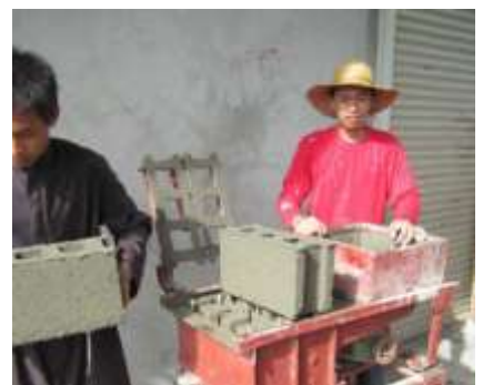
... and now the brothers are working overtime on their new hollow-block maker.