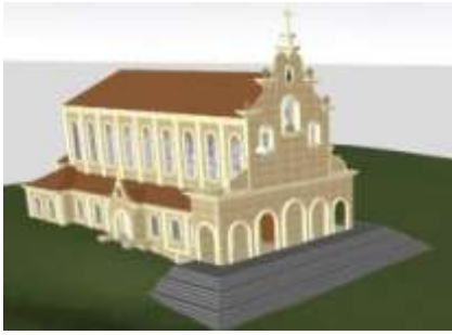
All projects start with a plan ...