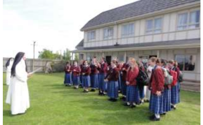
Girls' School assembly on a dry day.

To encourage teamwork, each student is allocated to one of three school teams, under the leader-