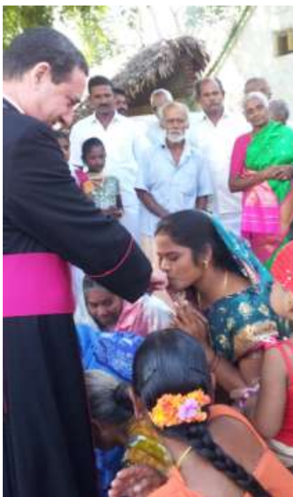
The holy women of R.N. Kandigai crowd the bishop to kiss his ring.

Grace like buses often come in threes; you wait for ages and nothing happens, then they all come at once. These last two months have