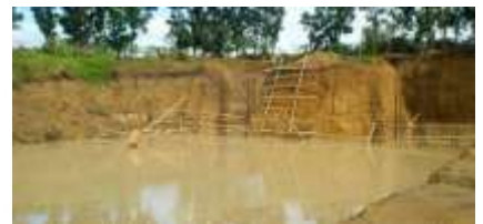
... until Satan organizes torrential rain to fill it up again ...