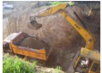
... but the hole is already dug, so there's no going back...