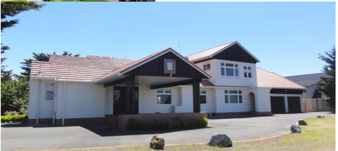
The newly acquired palatial property – it is actually now the convent.