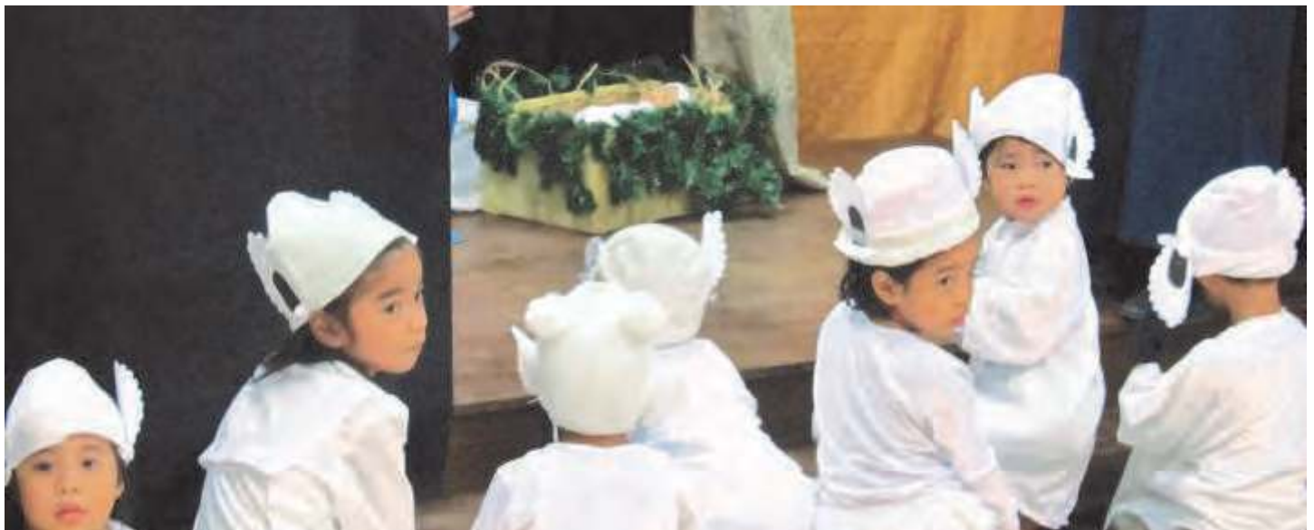
“Suffer the little children, and forbid them not to come to me.” (Mt 19:14) Hesitant little lambs come to adore the baby Jesus in the crib.

God wills it so, let us then march and sing together, that we and our children be joyful sons and daughters of God!