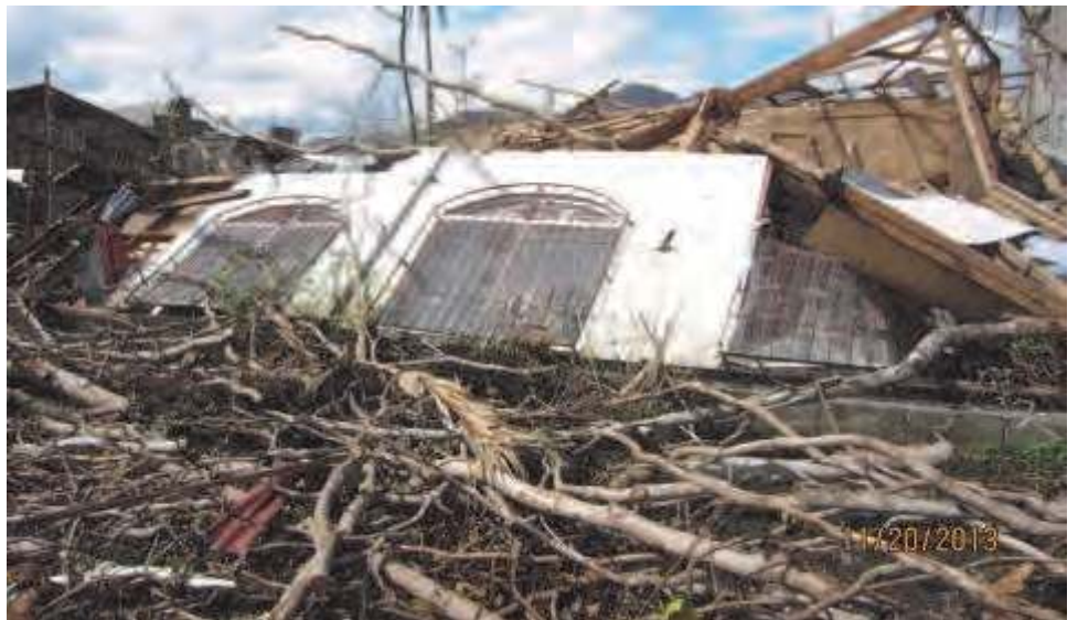
Holy Family Chapel, Tacloban, sustained significant storm damage in the typhoon....

Our chapel in Tacloban was always one of the small missions of our Filipino apostolate—about 20 to 30 souls. By the beginning of February it had risen to 105. It is another mystery of our strange human nature: to fall on our knees in difficult times and quickly forget Calvary when we are well and comfortable again. Ω