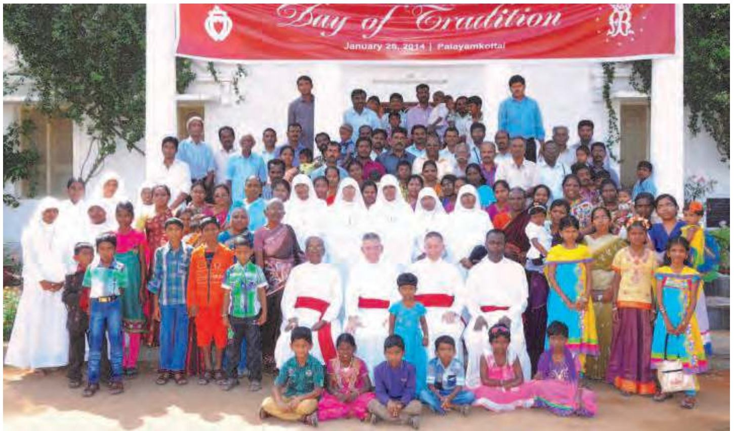
The religious and faithful of Tuticorin.