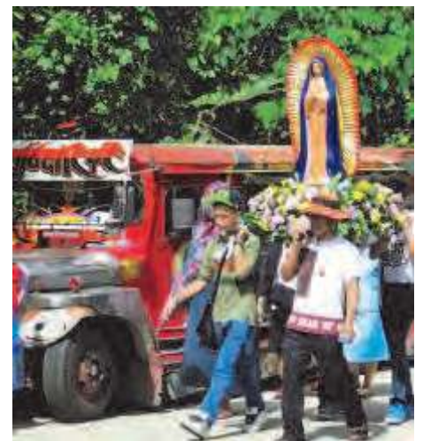
Pilgrimage to Laguna; Our Lady of Victories annual pilgrimage on 14th December 2013.