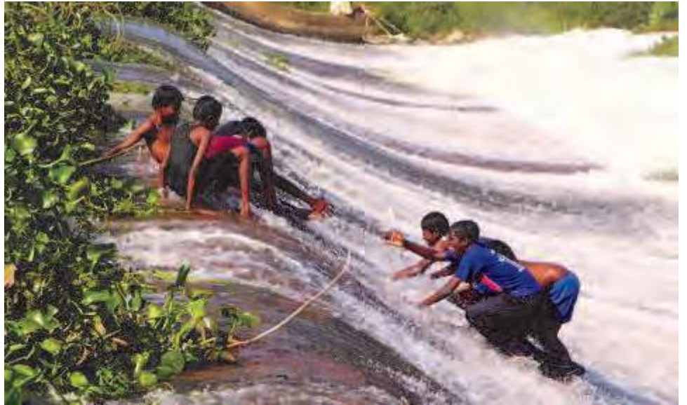
"You can do it!" The boys playing at the dam during our brief monsoon season.