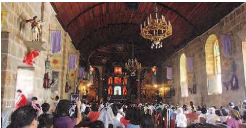
Saint James Church in Paeta (Laguna). The original church was built in 1646. It was rebuilt in 1717, destroyed by an earthquake in 1888, rebuilt, destroyed by another earthquake in 1937 and then rebuilt again. Paeta is renowned for its beautiful wood-carved statues.

Has the Good God abandoned His people? No, He gave to us Archbishop Lefebvre, and He charged him with the special task, after his long years of dedicated service to the Church, to work to form priests loyal to our Lord and to His mission. Hence, we have the Society of St. Pius X, in the past forty years up to the present, still forming an army of priests and religious after the Divine Model, and sending them throughout the world to give the sacraments as our Lord instituted them, to teach His truths and morals in unaltered fashion, to live His