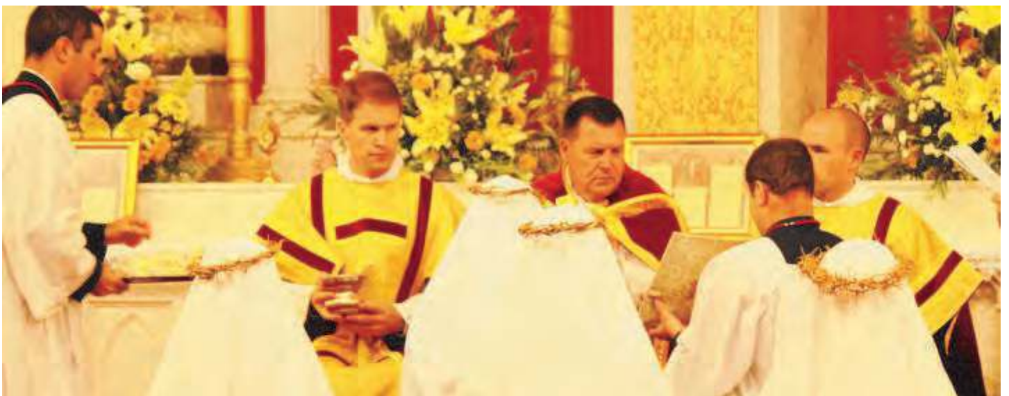
Four young novices, crowned with thorns rather than roses, receive a final blessing.

It was a day of exceeding great joy as four postulants, on the Feast of the Epiphany, received the holy habit. Our generous little ones asked the Church for God's mercy, laid down their hair for love of Him, chose the crown of thorns