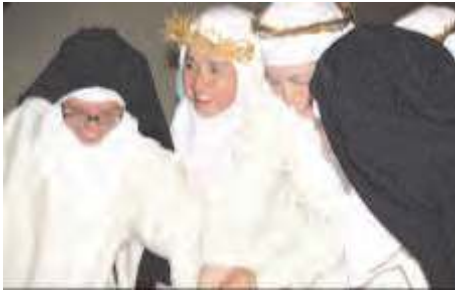
They might have to wear crowns of thorns, but no restrictions on cake!