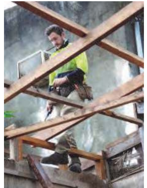
...but the Brothers and the Aussies soon put things right again (“no worries mate”);...