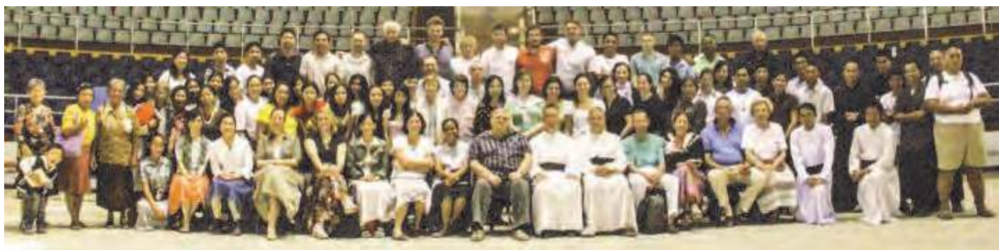
There were 115 volunteers from all four corners of the world who treated 3500 patients.