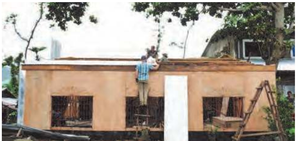
...in all, they rebuilt the chapel (above) and five houses of the faithful.