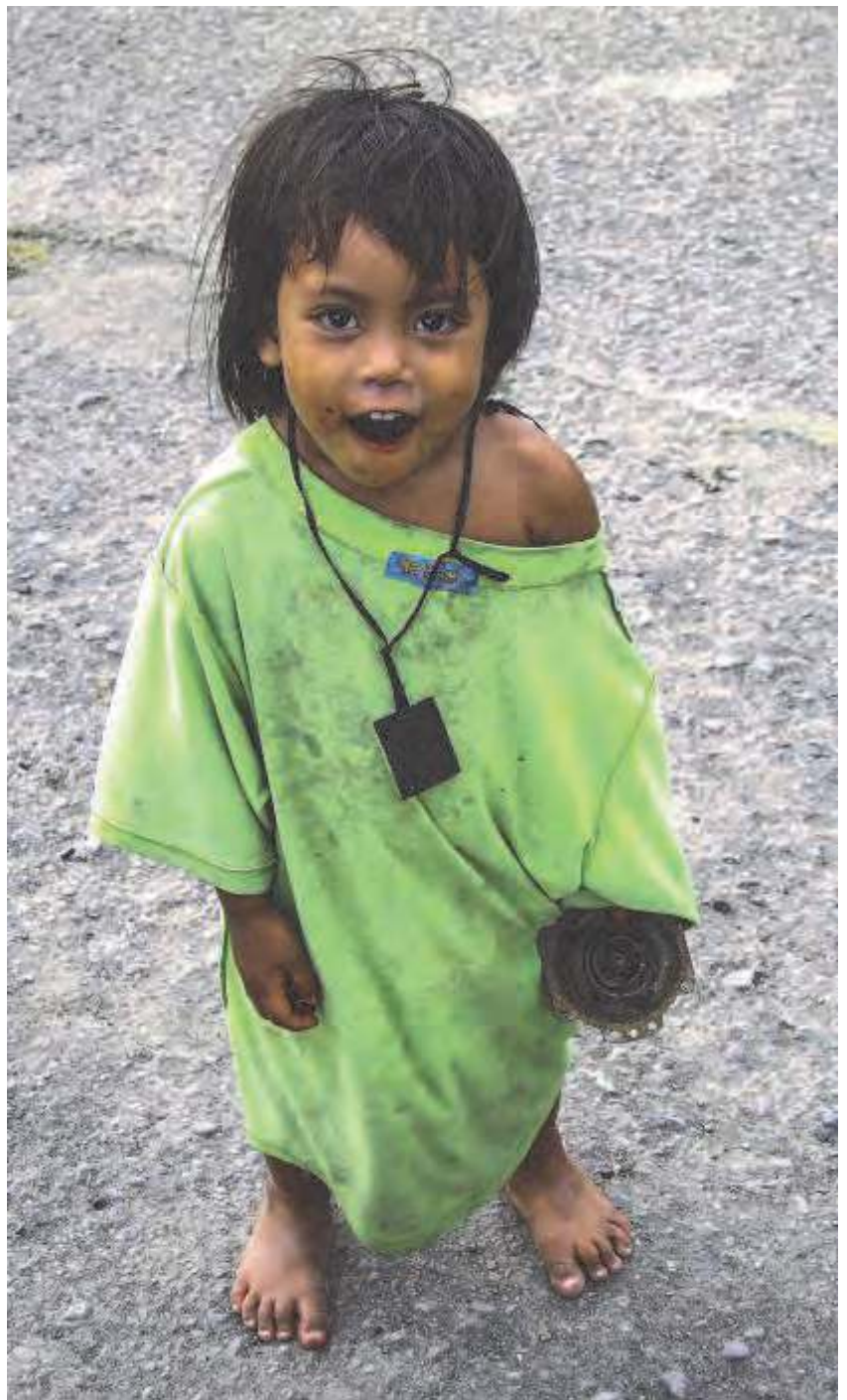
A princess of Tacloban, Philippines, clothed with the scapular, the royal garment of Our Lady of Mount Carmel.