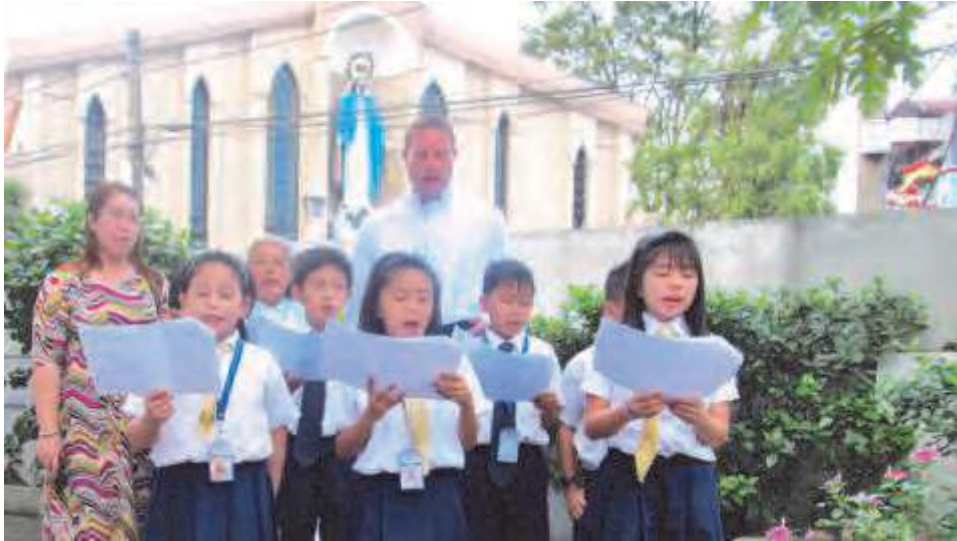
Carol singing by pupils in gratitude to benefactors .

Extracts from the magazine of Our Lady of Victories School, Manila