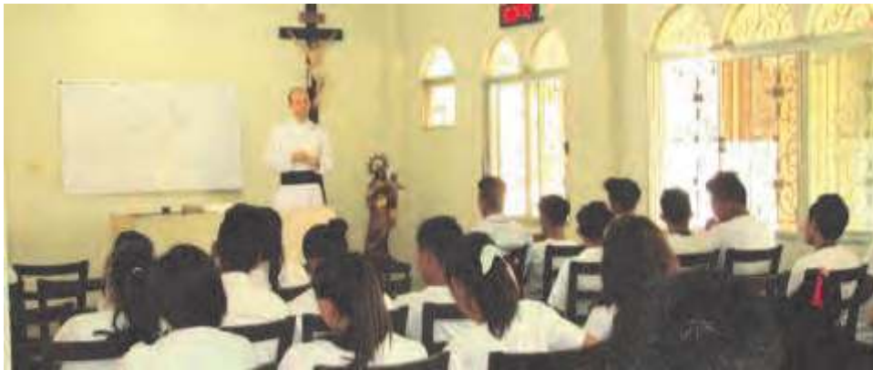
A day of recollection for the graduating class of Daga Public High School was held at the novitiate on Saturday 22nd March. All priests and brothers, and also the sisters participated in this work. Each priest gave a conference. Hopefully it has put a little mark on the souls of these children. Hopefully we will be able to do more in this line.