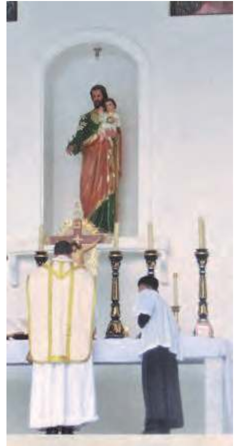
Mass being celebrated at the new shrine of St. Joseph at the priory.

life and to give His life to souls awaiting.