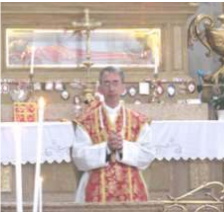
Sermon at the altar of St. Lucy, Venice (2010)

house of Bethany for young ladies searching their vocation, a primary and secondary school (Our Lady of Victories School with 63 students in June 2014) and about 2,500 faithful scattered in 27 regular Mass centers.