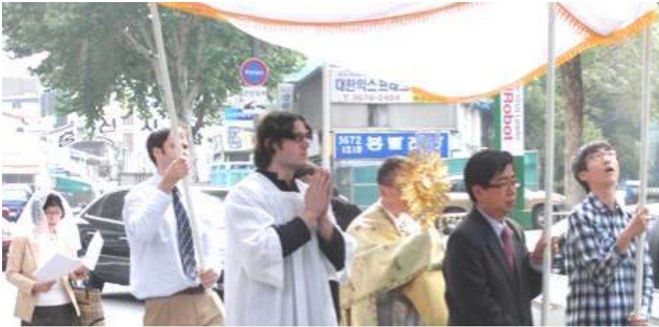
Blessed Sacrament Procession in South Korea (2008)