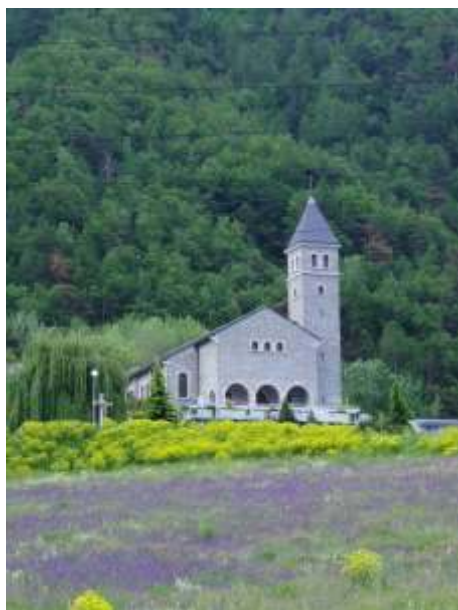
Ecône, Switzerland 1998