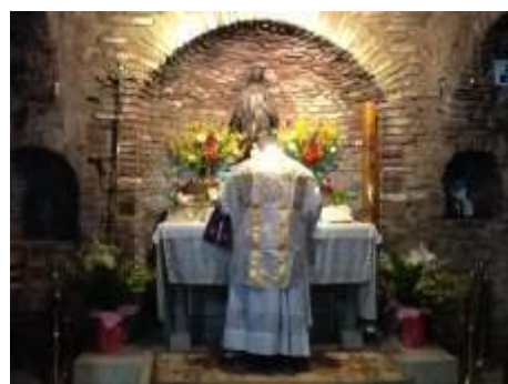
The Holy Sacrifice of the Mass in Our Lady's House.