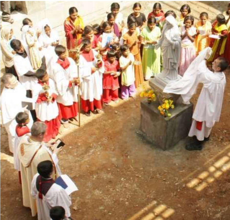
Blessing of the new orphanage building of the Consoling Sisters of the Sacred Heart, India (2010).

126:4), flying hither and thither, sowing in tears that we may one day reap in joy.