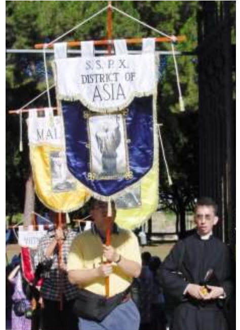
Rome Pilgrimage (2000)