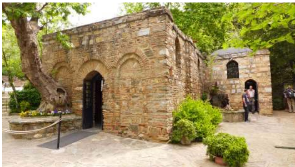
The 1st century foundations of Our Lady's House were discovered in 1881 beneath a 6th-7th century ruin on Nightingale Mountain near Ephesus. The chapel built upon the same foundations is now an edifying and delightful pilgrimage destination.