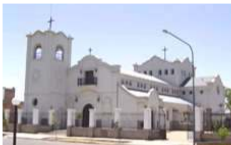
Le Reja 1998, Mendoza 2002 in Argentina.