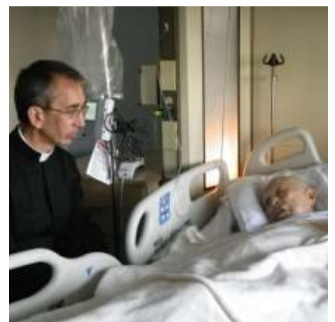
...and was rewarded with a happy death—fortified by the Rites of Holy Mother the Church. (RIP 2013).