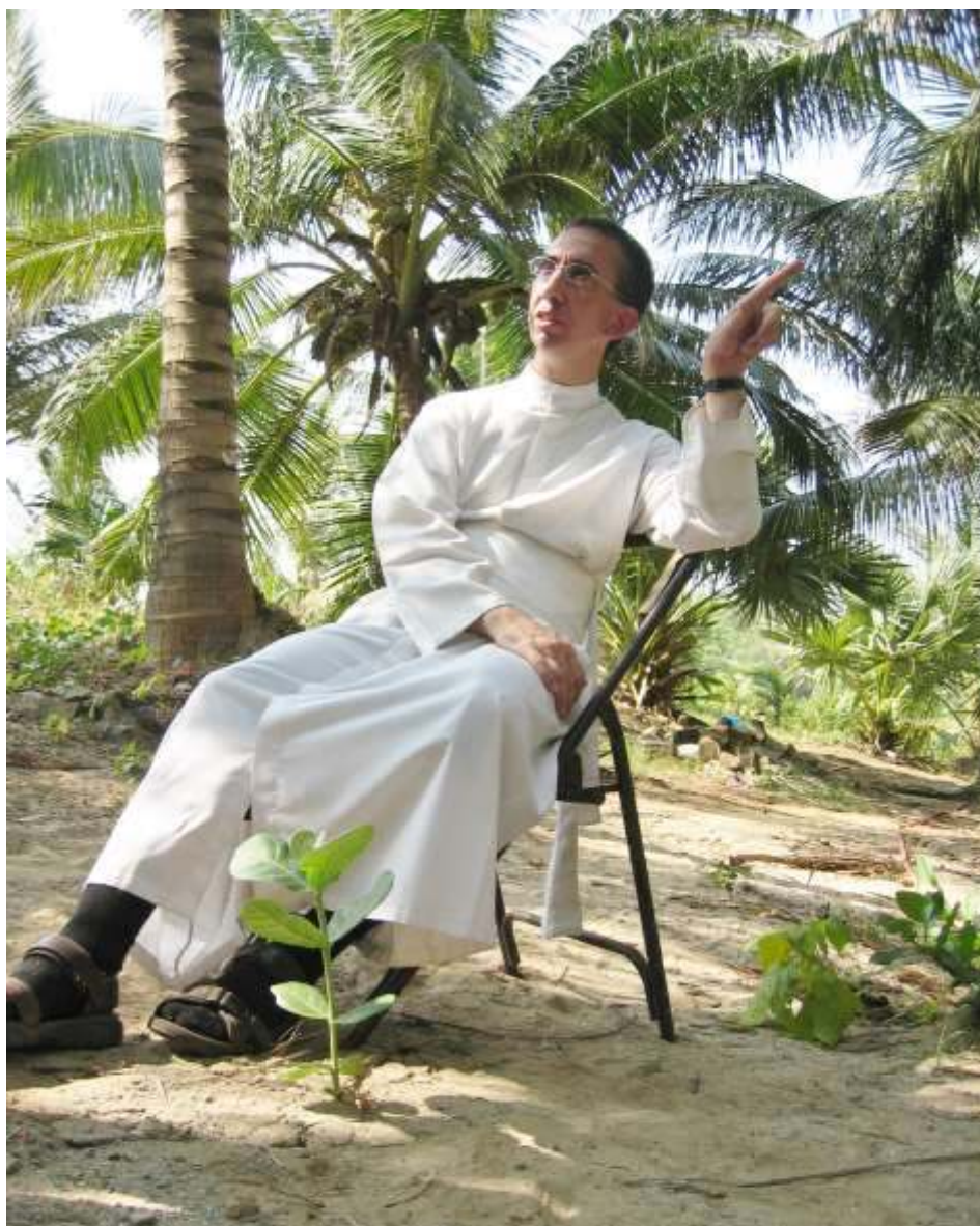
“Er... Yes, just send it on to my new office: District House, Canada.....”