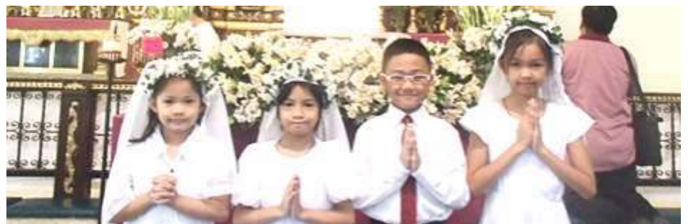
First Holy Communicants on the feast of St. Joseph.