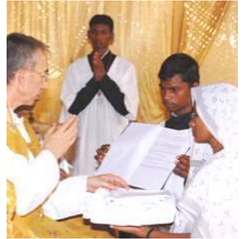
A new pious union for India, the Reparation Sisters of the Immaculate Heart of Mary (2013).

when we read the history of the Missions over the centuries. Leaving Our Lady in the driving seat as ‘her passenger’ and messenger, I witnessed her power, the power of prayer, of the communion of Saints, and saw with my own eyes grace showered everywhere.