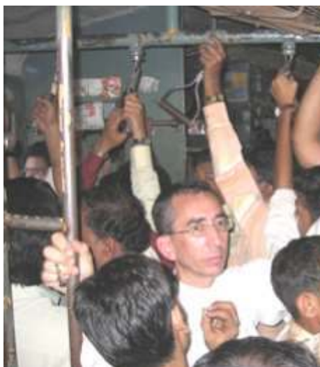
On the metro in Mumbai, India.