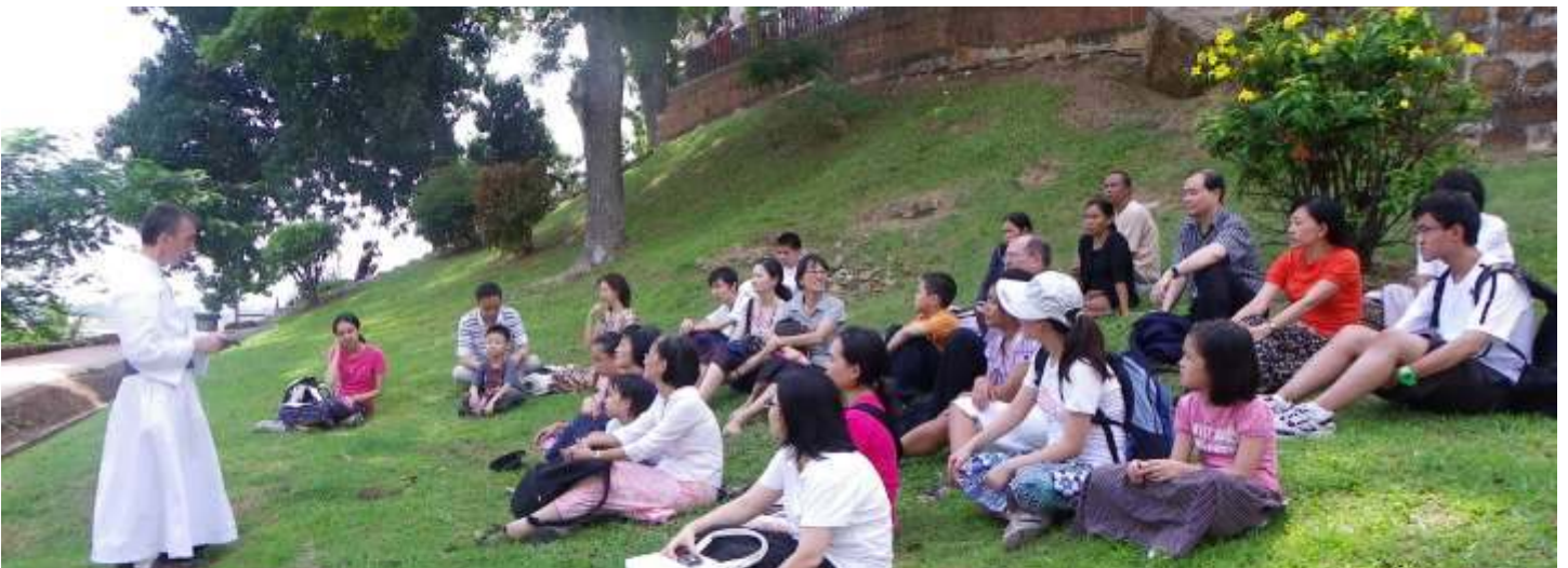
Sermon on the Mount in Malacca (2010).

The third priory we had in 1996 was in India with 3 priests, 8 Mass centers, and approximately 300 faithful. Now they still have 3 priests, but with one brother, two communities of sisters (the Consoling Sisters and the Reparation Sisters, a total of 10 sisters), a priory with 35 boy orphans and boarders, an orphanage and old people’s home with 49 girls and 10 old ladies, one school