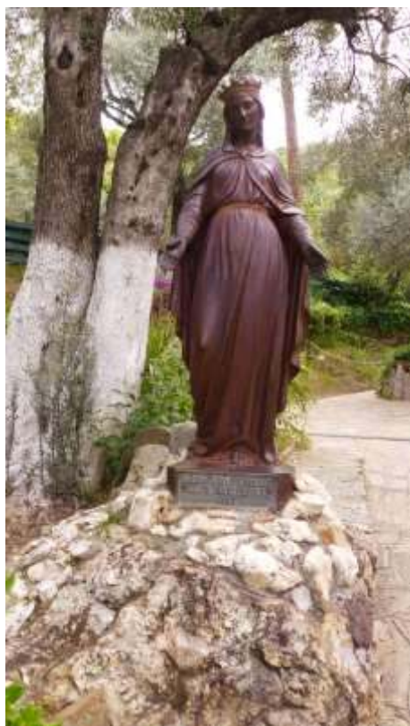
Statue of Our Lady of Ephesus. The inscription reads in French, "They have made me their guardian. 1867."