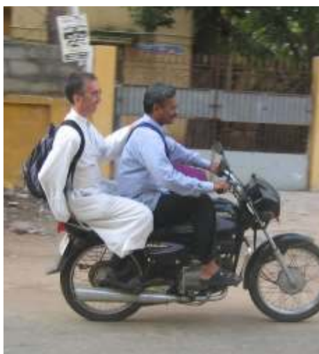
On the moto in Madras, India.