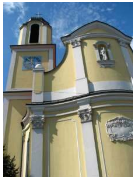
Stuttgart, Germany 1998