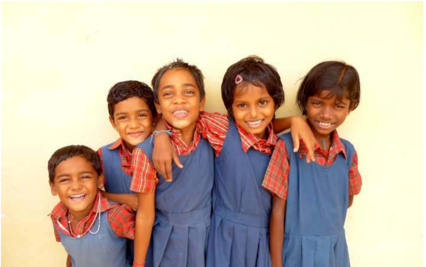
Some Virtues and Angels of Veritas Academy.