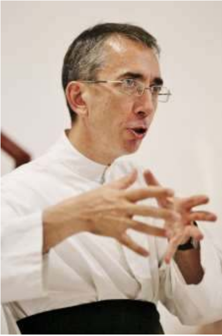
“The faith! ...it’s worth more than a pearl this big!”