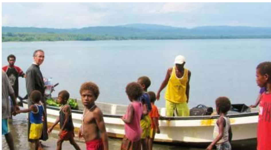
Island hopping in Vanuatu in the Pacific Ocean.

still immense and the workers still so few. At the same time, I ask you not to forget me in my new field of apostolate, my dear Canada.