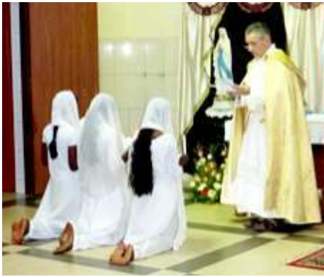
Three young ladies were received into the Sodality of the Children of Mary on the feast of the Visitation of the Blessed Virgin Mary.

of seeing two ladies and one girl from the orphanage receive the sacrament of baptism and two girls making their first holy communion.