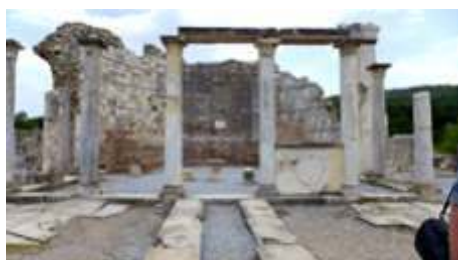
The ruined sanctuary of the Church of Mary—the first church to be dedicated to the Blessed Virgin Mary (c.430)