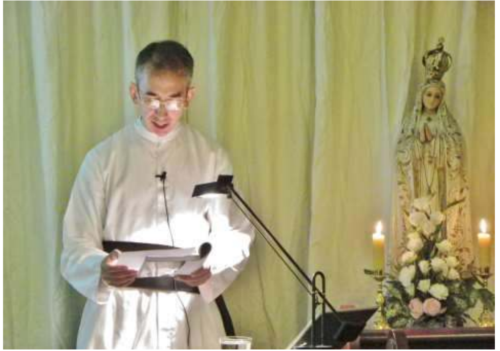
Putting the entire mission in the hands of the Immaculate.