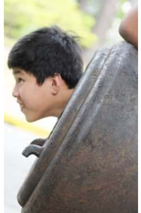
...but another pupil was threatened with expulsion.