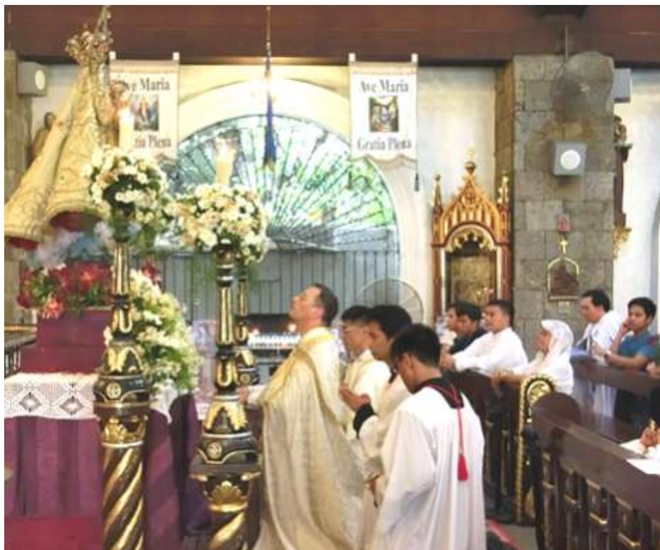
Veneration of the Blessed Virgin Mary on the solemnity of the feast of the Most Holy Rosary. This year (2014) was the 800th anniversary of the revelation by the Blessed Virgin Mary to St. Dominic of the rosary as the principal weapon to reform the world.

I could continue to talk about similar experiences in Singapore, Borneo, India and I will probably find the same situation where I have not yet been. How can one not trust entirely the Immaculata when he sees such fruits of HER presence through devoted instruments!