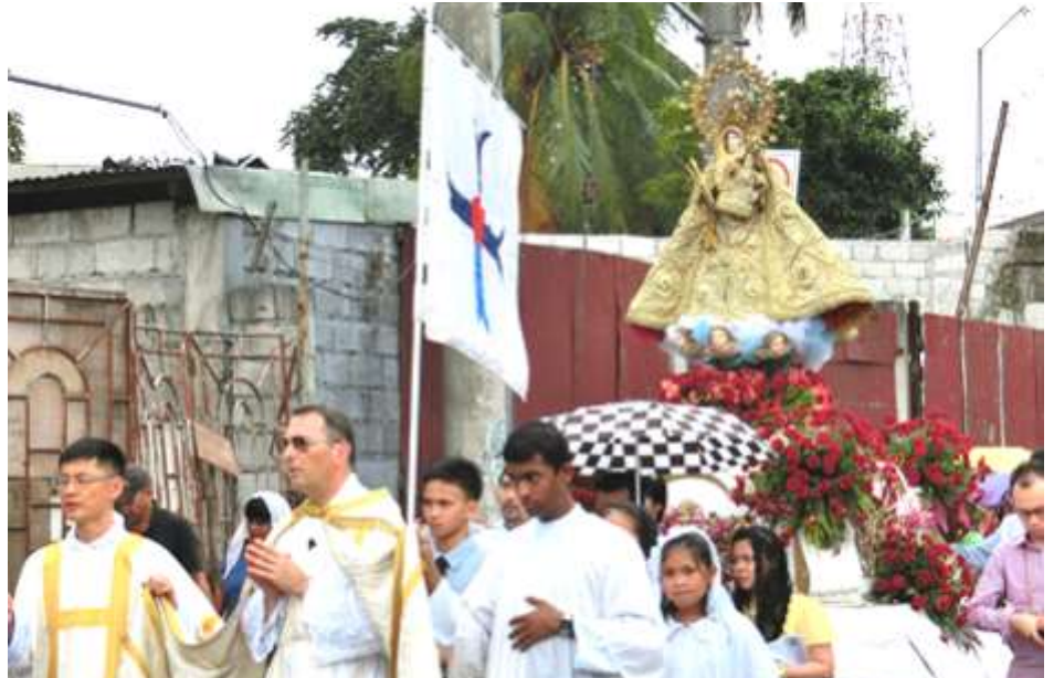
A grand procession through the streets surrounding Our Lady of Victories Church followed Solemn High Mass on the solemnity of the feast of the Most Holy Rosary on 12th October.