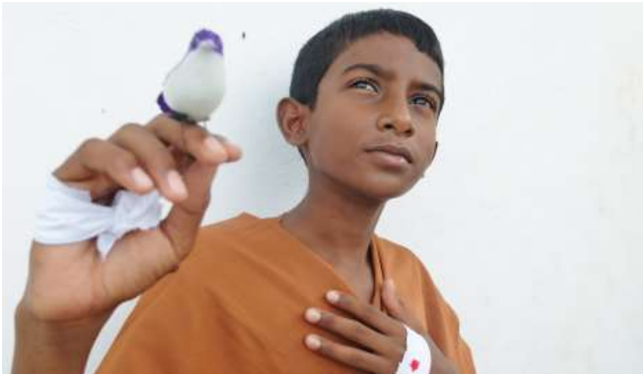
"Lord, make me an instrument of Thy peace." St. Francis of Assisi (Simeon).