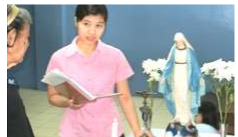
Taking the Legion of Mary pledge.