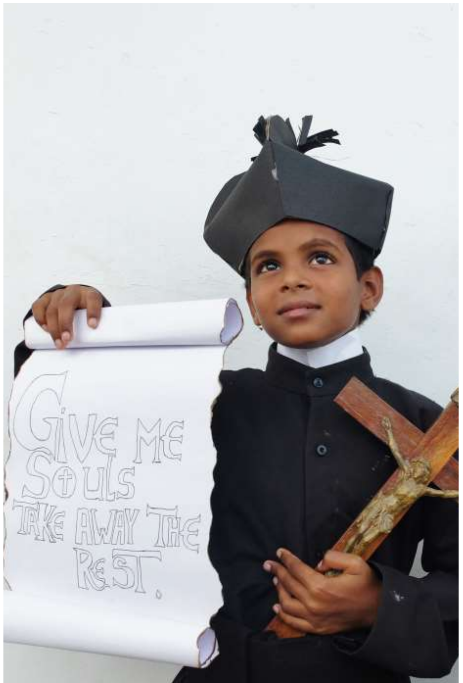
St. John Bosco (Maryson) on a mission on All Saints Day.