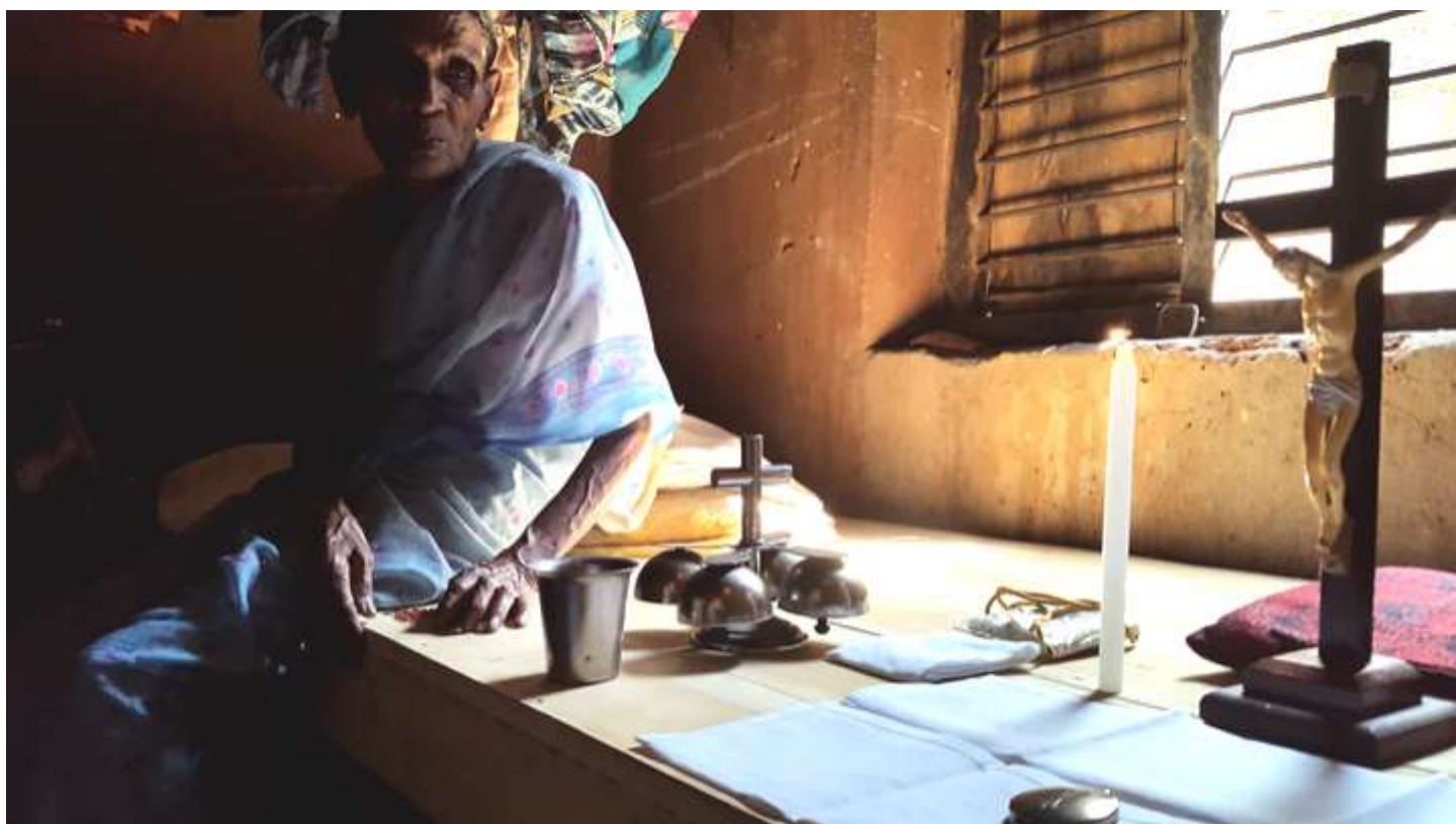
Sick call at the village of Christurajapuram.

Domine non sum dignus ut intres sub tectum meum.