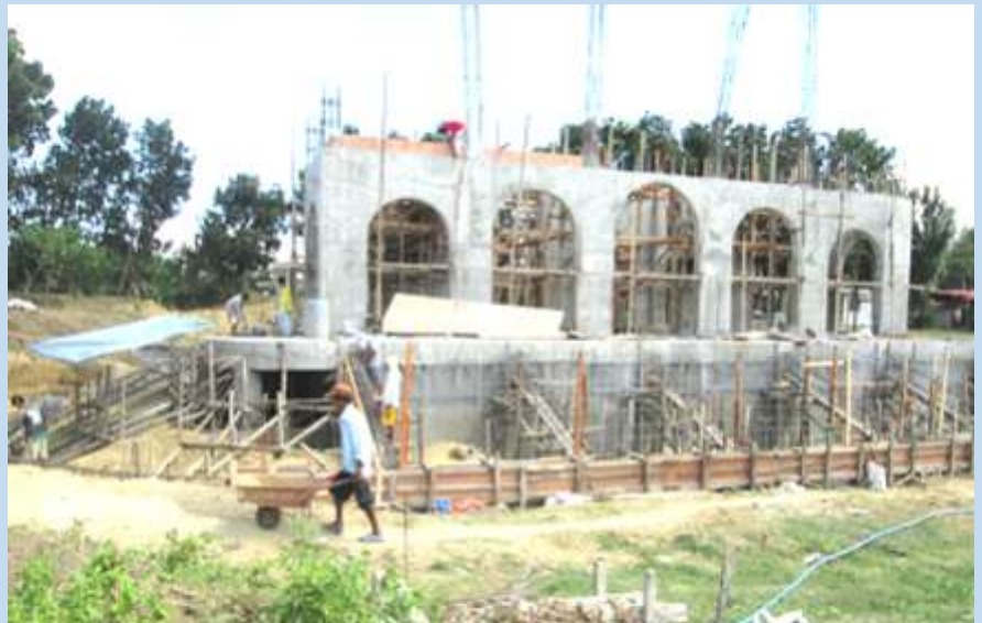
The façade of the church is taking shape. A grand staircase will lead up to the front of the church and beneath the groundfloor there will be space for a hall and crypt. The interior pillars are 13m high and the choir loft will be 5m above the nave.