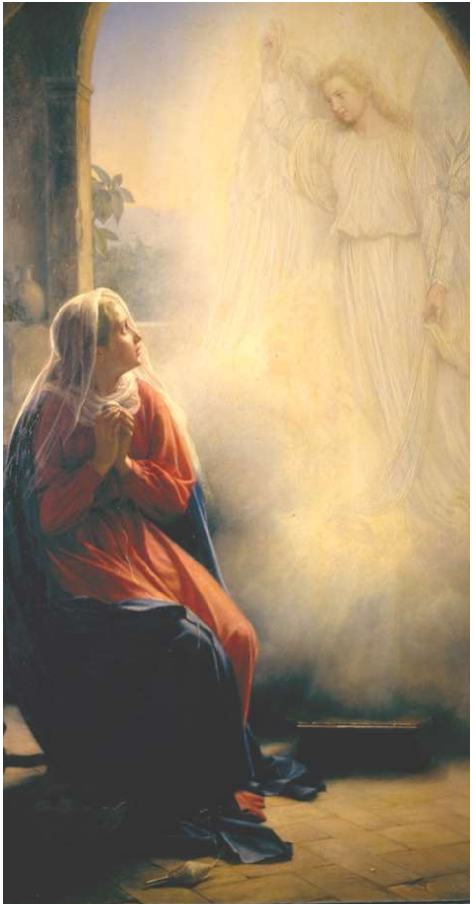
The Annunciation, Carl Bloch (1834-1890).

Archbishop Marcel Lefebvre changed history—this will become clearer in time. One day, his "fiat" will be held high and acknowledged as a glorious echo of Mary's "fiat". Perhaps this is why God called the Archbishop to himself on the feast of the Annunciation, the feast of the day of Mary's "fiat" so that, following his example, our "fiat" too may echo harmoniously with hers. Ω