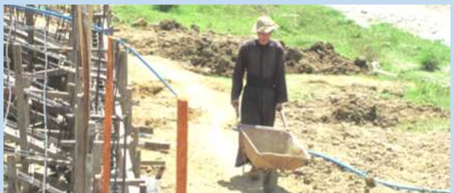
A lone brother on the building site. It's always the same.