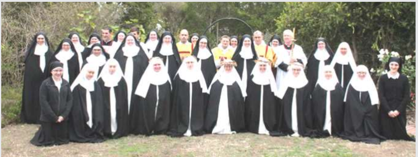
On 17th January 2015, five ladies received the religious habit to become novices, three pronounced their first temporary vows and two renewed their vows. The community is blessed with vocations ...all it needs now is a convent. See www.dominicansisterswanganui.blogspot.com