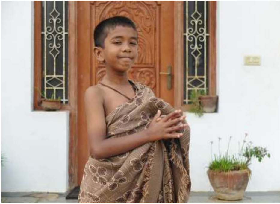
"Make straight the way of the Lord!" A smug looking St. John the Baptist (Arul) in a rug.