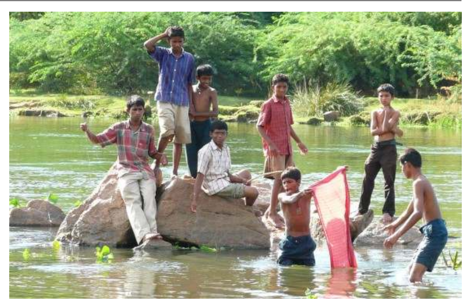
Age of innocence: messing about by the river with the first orphan boys (2009)