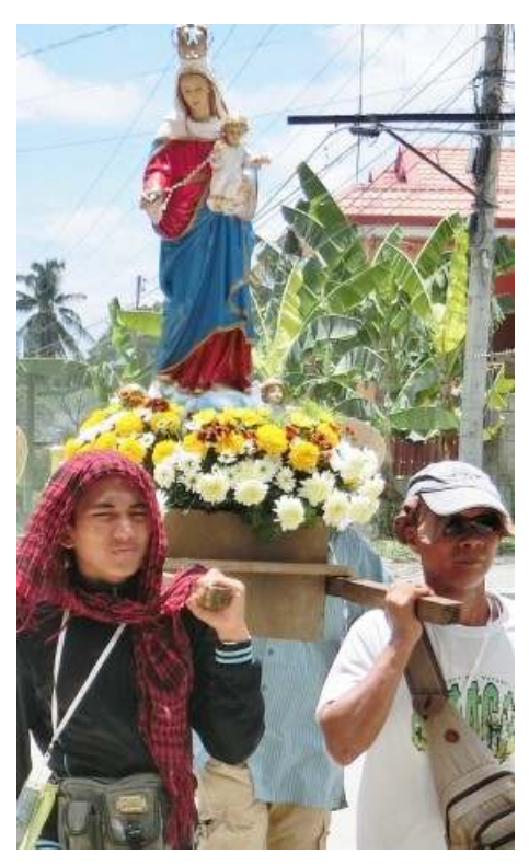
On the way to Fatima Hill, more than 1000 pilgrims honoured the Blessed Mother of God with their prayers, toil and laughter.