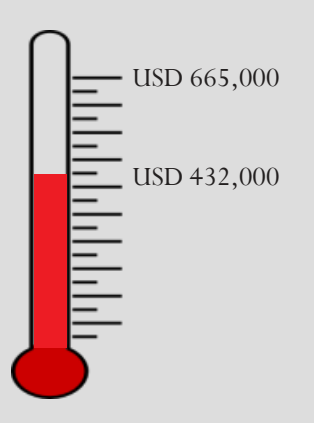
St Joseph, pray for us!

http://www.sspxasia.com/ Countries/Philippines/St. Bernard/ Main_Page.htm