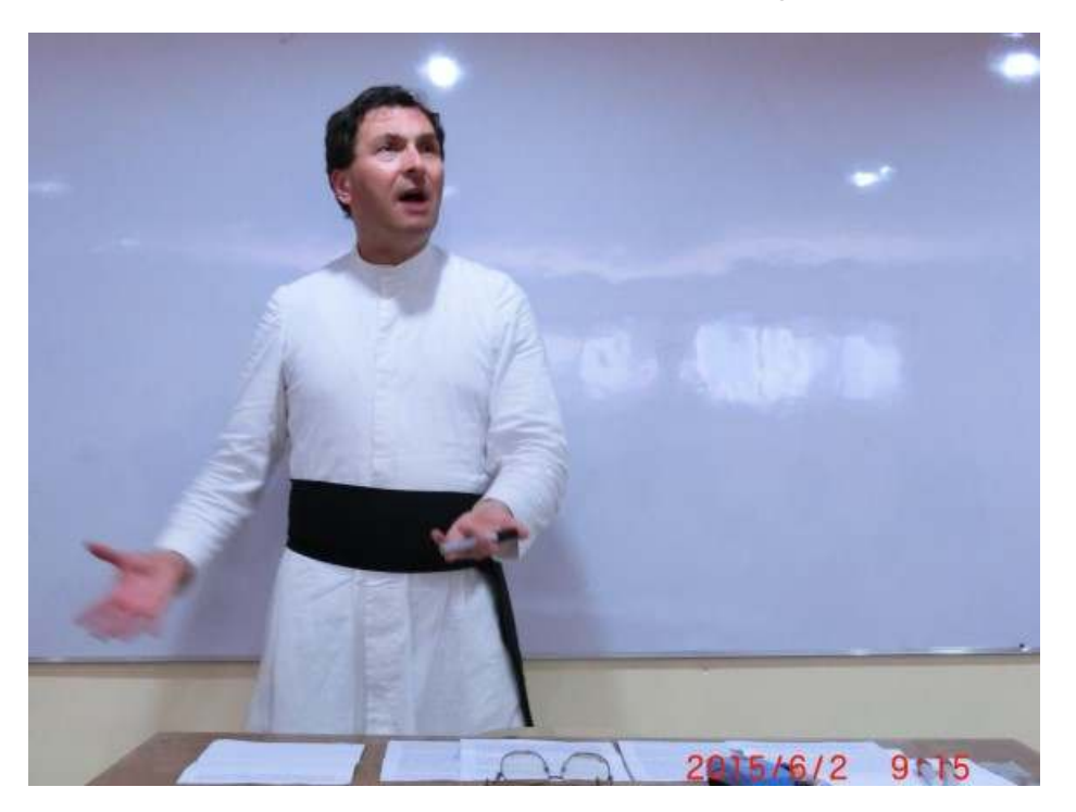
"My dear faithful, you simply cannot imagine what treasures Mother Mary will pour into your intellect and heart if you just take the trouble of making her acquaintance!"

To whom does God reveal all this depth of knowledge about Himself? On-