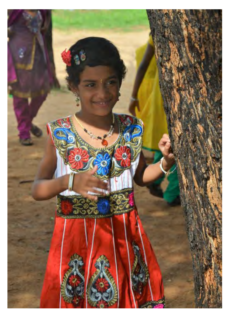
Believe it or not, this is considered "dressing down" for our little princess.