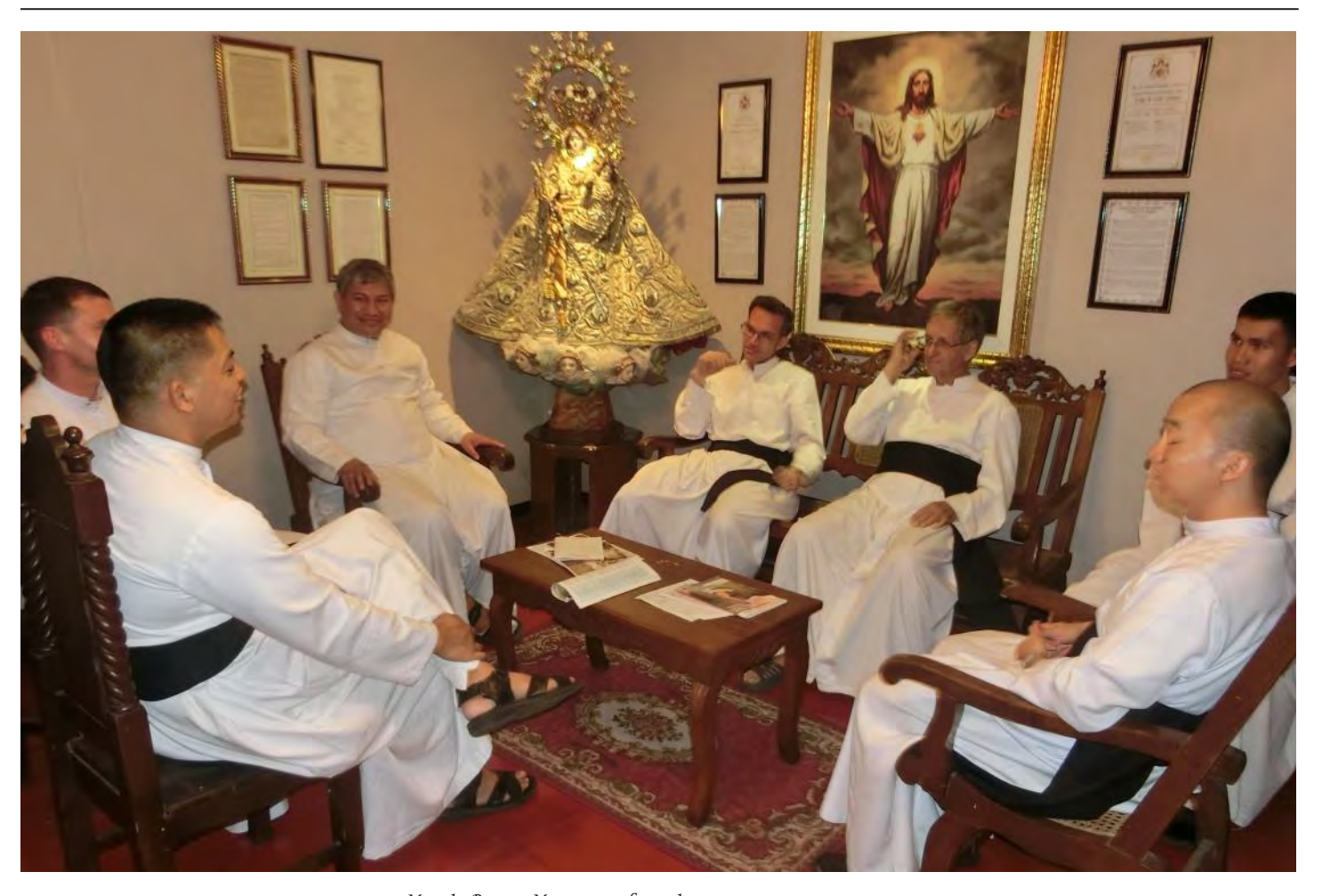
Manila Priests Meeting: informal conversation among priests. "How good and how pleasant it is for brothers to live together in unity!" (Ps. 132)

\sim Newsletter of the Society of Saint Pius X in Asia \sim