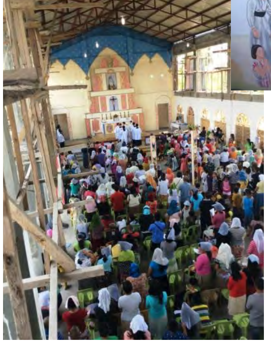
The Immaculate Heart of Mary protects the Rosa Mystica Mission and all the dedicated volunteers.

Rosa Mystica Herself showed Her blessing and intervention by inspiring 193 people to consecrate themselves to Her after the the Church to rise. In spiritual supplement, Mass, in the ceremony of enrollment in the former patients of past Rosa Mystica mis- Militia Immaculatae. This symbolic guaransions, who not only turned to God through tee of the future of the Rosa Mystica Misthem but became Mission workers, were sion is a pledge of the Immaculata's continon hand for the ceremony as Altar boys and ued protection and beneficence to Her organization volunteers in their own servants, for She who inspires generosity,