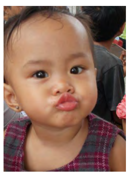
"Thank you so much for your support! Smack!"

Rosa Mystica Herself showed Her blessing and intervention by inspiring 193 people to consecrate themselves to Her after the the Church to rise. In spiritual supplement, Mass, in the ceremony of enrollment in the former patients of past Rosa Mystica mis- Militia Immaculatae. This symbolic guaransions, who not only turned to God through tee of the future of the Rosa Mystica Misthem but became Mission workers, were sion is a pledge of the Immaculata's continon hand for the ceremony as Altar boys and ued protection and beneficence to Her organization volunteers in their own servants, for She who inspires generosity,