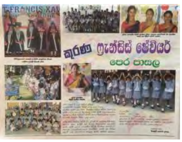
Local papers talk about us.