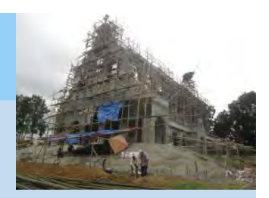
In the meantime, down below, the window mouldings are slowly fitted... only another 34 windows to go!!!