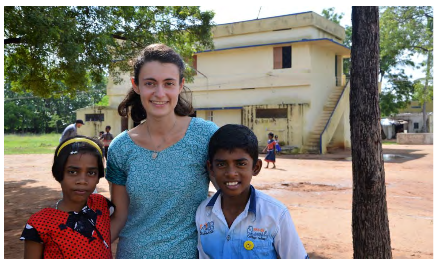
Each volunteer who comes to our aid in India is a manifestation of God's goodness. These young men and women arrive as strangers. They leave as family.