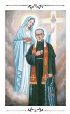
THE KNIGHTHOOD OF THE IMMACULATE VIRGIN MARY