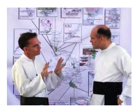
"Can you play RISK? No? Then, you won't understand what I mean by M I's conquest of the world."