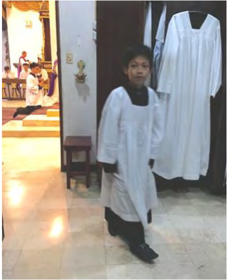
"I want to become a priest. That's why my surplice looks like an alb!"

foundations of a youth movement in Trichy least 100 000 Knights, so that she may