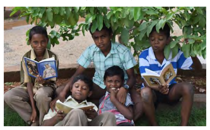
During the outdoor reading hour, some of our youth imitate the act of reading alarmingly well. Even so, we are very proud of them!