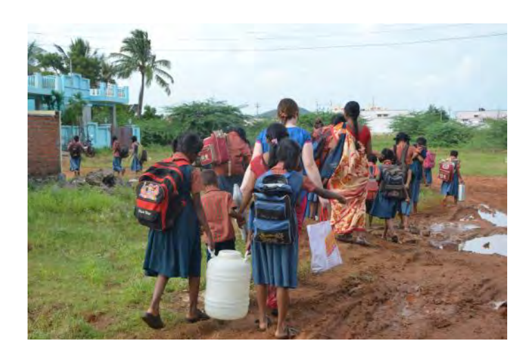
Watching people trudge through six inches of sludge in flip-flops is hilarious to an outside observer. But doing it is significantly less funny.