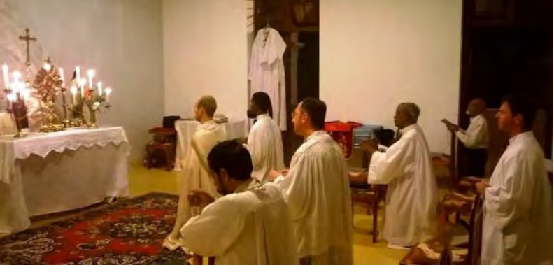
Mid-January, a priestly retreat takes place in Negombo.

An old building is knocked down to enable the construction of the church.