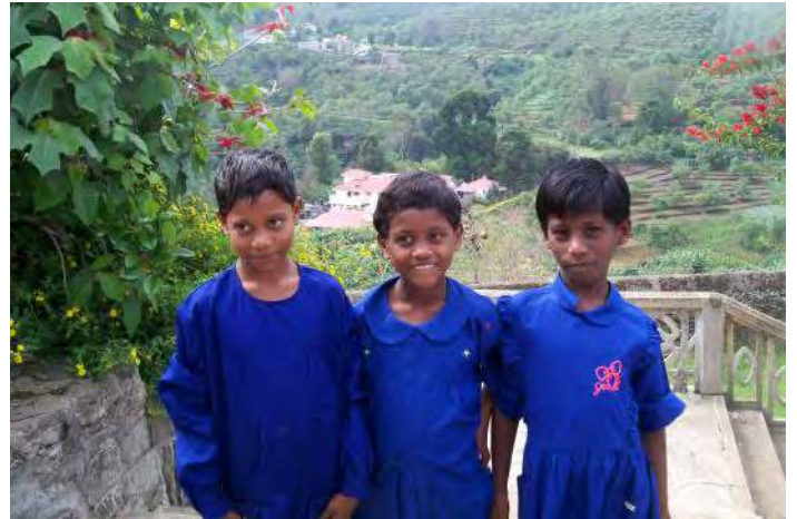
As part of our next fundraiser, three of our students will be performing in Blue Man Group for audiences around the globe.