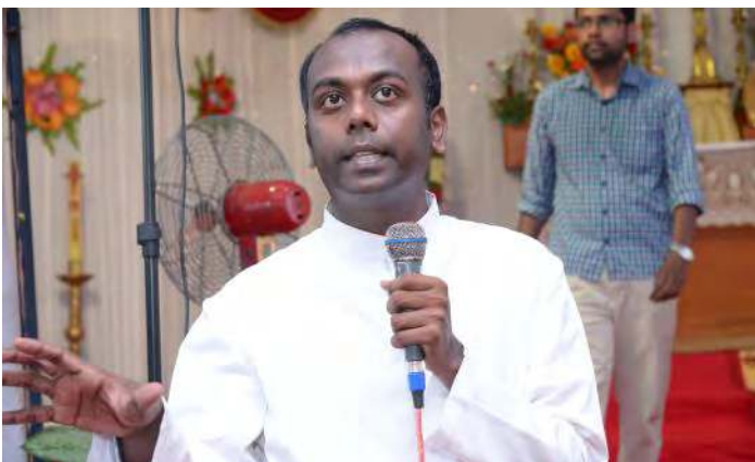
Father desperately attempts to calm his riotous parishioners after the chapel's one fan suddenly stopped blowing air.