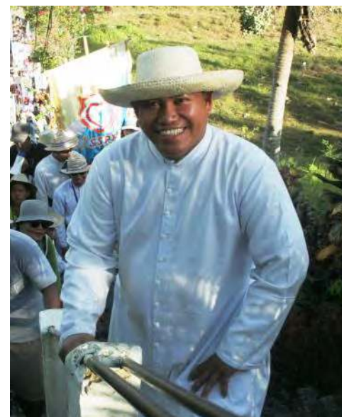
"My secret? COLGATE, of course!"

#4. It is a witness of Catholicity. A big gathering of Catholics from all walks of life, and geographical regions, is a sign of Catholicity, but the visiting of Catholic