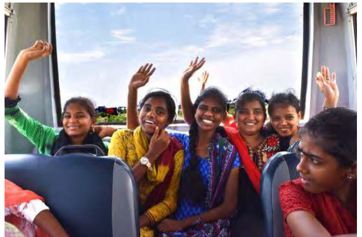
Boom, Boom, ain't it great to be crazy? For some reason, the back seat of the bus makes kids zany!