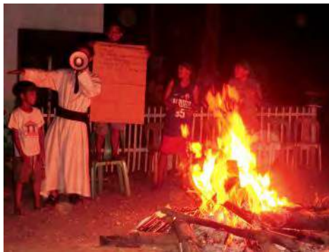
"Those acting as Poor Souls, come closer, please!"

In this environment, for three years now, the main focus of the Mindanao Apostolate has been to set up catechism centers based on apostolic leads through the Legion of Mary and try, through consistent catechism, to foster in the children a sacramental life, and through them, to establish this sacramental life in their families.