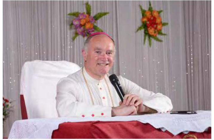
Conference on the current situation in the Church