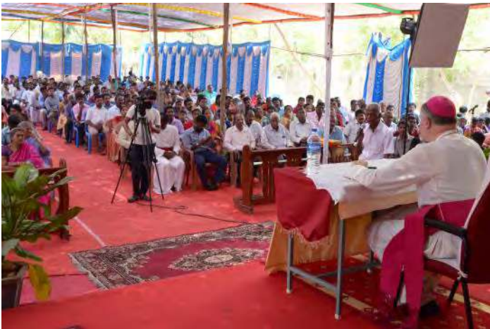
The attentive crowd