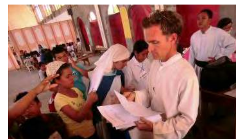
“Dang! I can’t read their names without my glasses.”