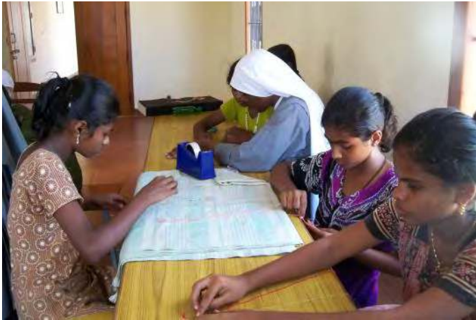
Based on their current speed, the Needlework Team should be finished sewing their dresses in February, 2018.