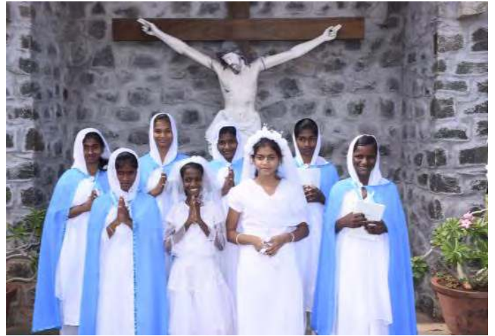
Six girls joined the Sodality of the Children of Mary on August 15th and two girls received first communion.