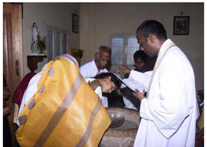
The life-saving waters flowing over Assunta Glory on the feast of the Assumption.