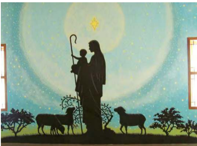
The final picture. It is like in Heaven!