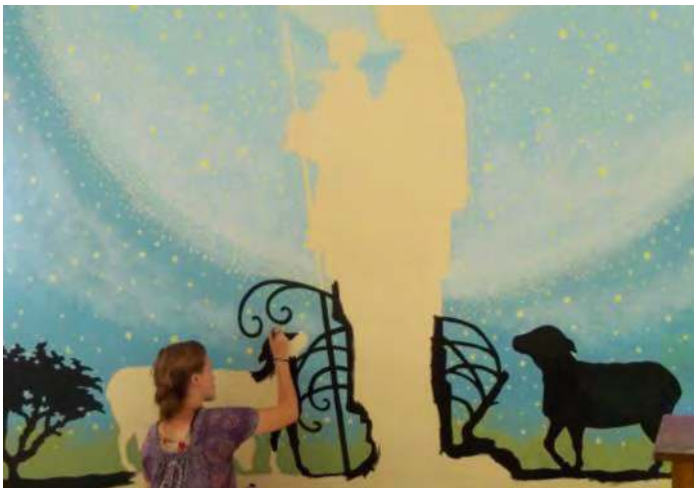
The artistic volunteer Bridget Elliott from Australia beautifying the study room of the girls.