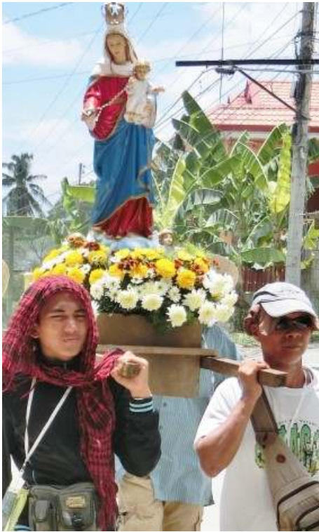
On the way to Fatima Hill, more than 1000 pilgrims honoured the Blessed Mother of God with their prayers, toil and laughter.