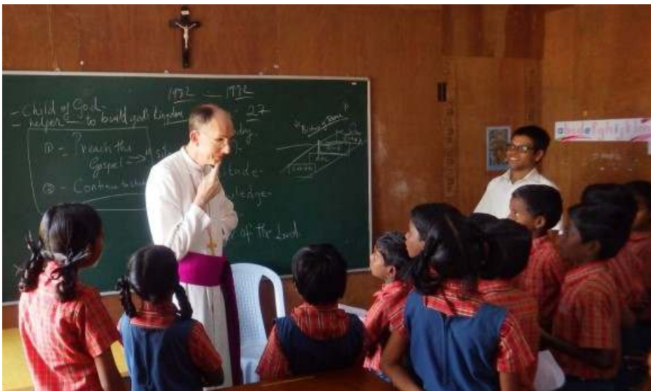
"So children, for your homework I want you to answer this question: 'Bearing in mind that Adam had the praeternatural gift of integrity, why did he eat the forbidden fruit?'"