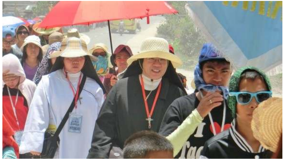
Oblate Sisters in the throng under the heat of the midday sun.