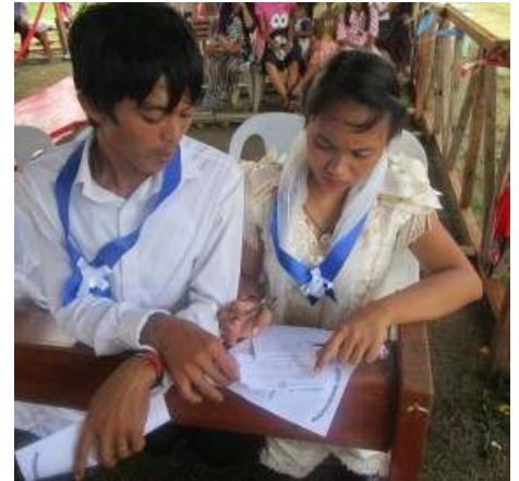
Newlyweds consecrated to Mary.

How does one become a Knight of the Militia Immaculatae? This is effected by consecration to Mary according to the formula written by St. Maximilian Kolbe, and then by wearing always, or at least by keeping on one's person, the Miraculous Medal. More particularly,