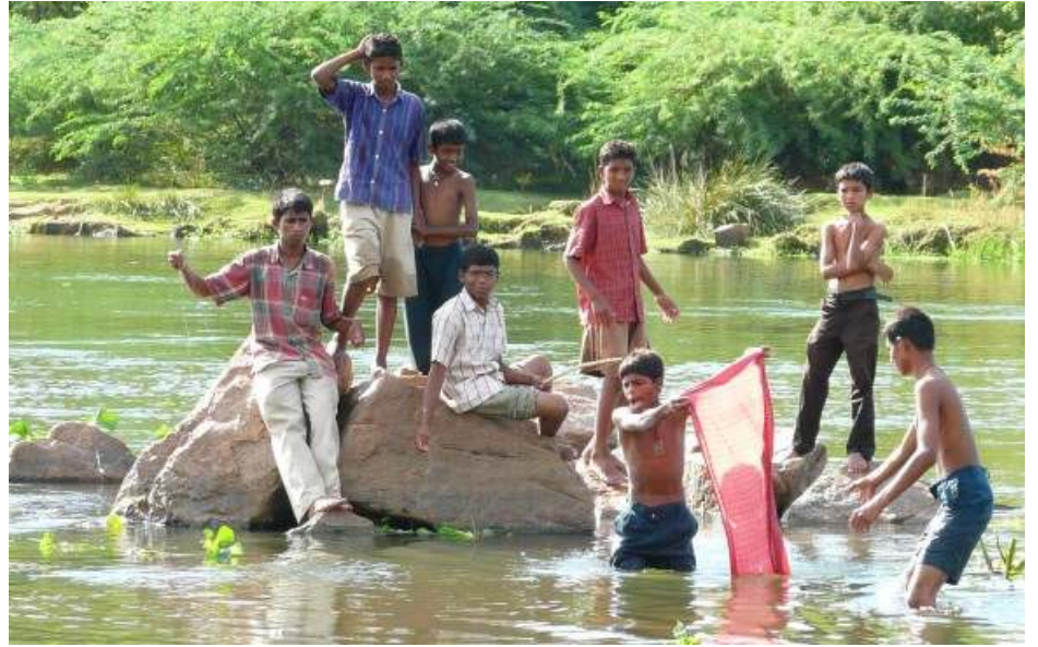
Age of innocence: messing about by the river with the first orphan boys (2009)