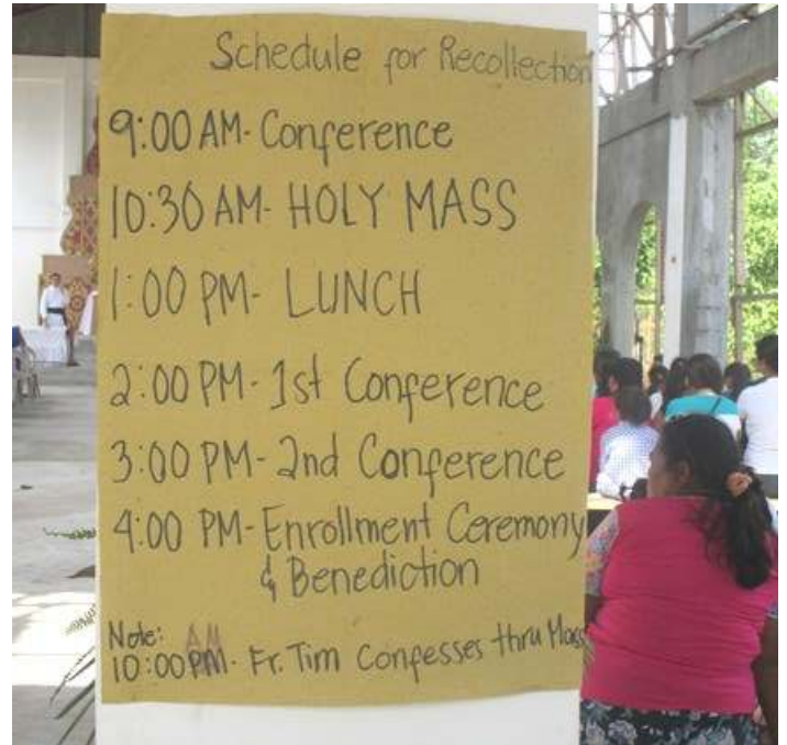
In Catholic tradition the two most important events are HOLY MASS and LUNCH—hence the capital letters.

Maybe the greatest surprise of Our Lady was the enrolment of 44 knights in China. Enrolment forms and certificates in the Chinese language had been prepared. They are the most beautiful the Militia has ever seen. I am sure, that Saint Maximilian must have had an immense joy to assist from heaven at that cer-