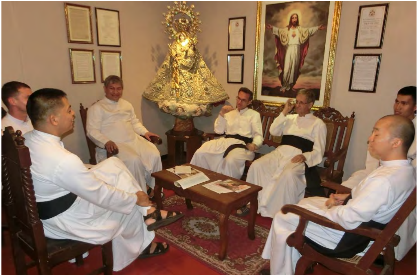
Manila Priests Meeting: informal conversation among priests.

~ Newsletter of the Society of Saint Pius X in Asia ~