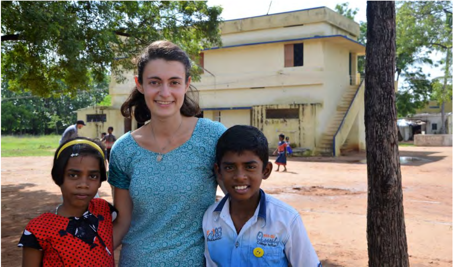
Each volunteer who comes to our aid in India is a manifestation of God's goodness. These young men and women arrive as strangers. They leave as family.