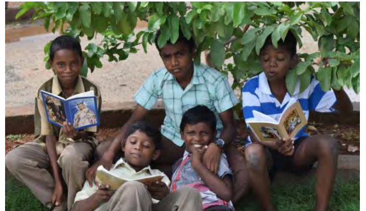
During the outdoor reading hour, some of our youth imitate the act of reading alarmingly well. Even so, we are very proud of them!