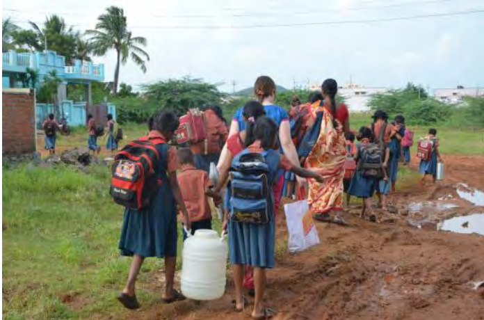
Watching people trudge through six inches of sludge in flip-flops is hilarious to an outside observer. But doing it is significantly less funny.