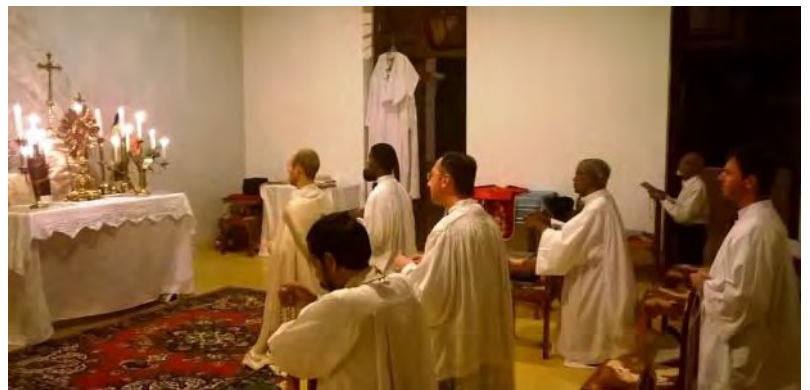
Mid-January, a priestly retreat takes place in Negombo.

An old building is knocked down to enable the construction of the church.