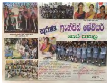
Local papers talk about us.