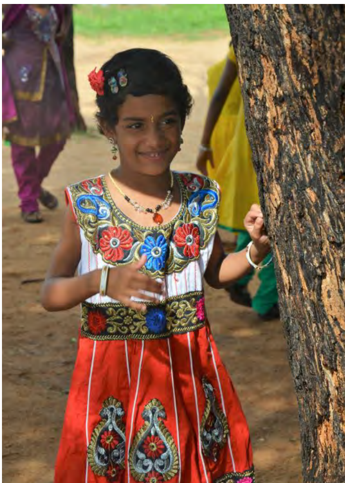
Believe it or not, this is considered “dressing down” for our little princess.