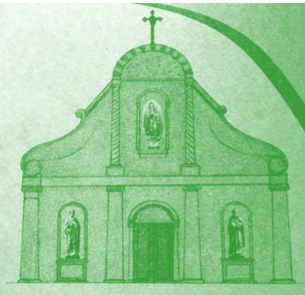
Our Lady of Guadalupe Church