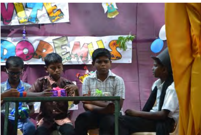
The child in the middle is visibly distressed. "This better not be something useful!"