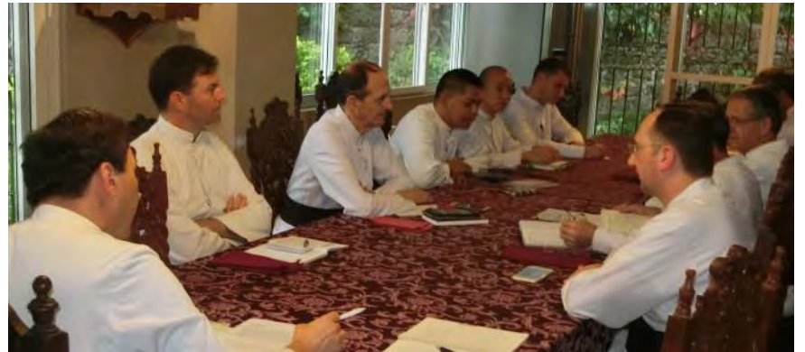
Every morning, conferences on Fatima: “The angels in the work of salvation”, “Theology of reparation”, “The united Hearts of Jesus and Mary”, etc. Round Table on pastoral issues, in the afternoon.